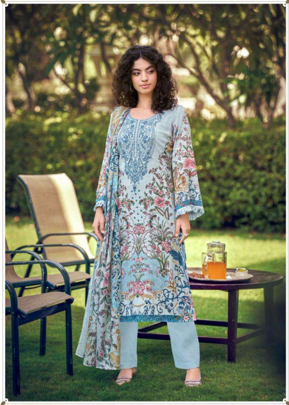
Gorgeous ethnic attire that Snow Attention Around by this Label; be a stylish with Bellini.