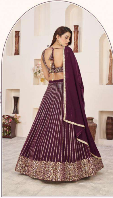
In a world full of trends, i want to remain a classic.