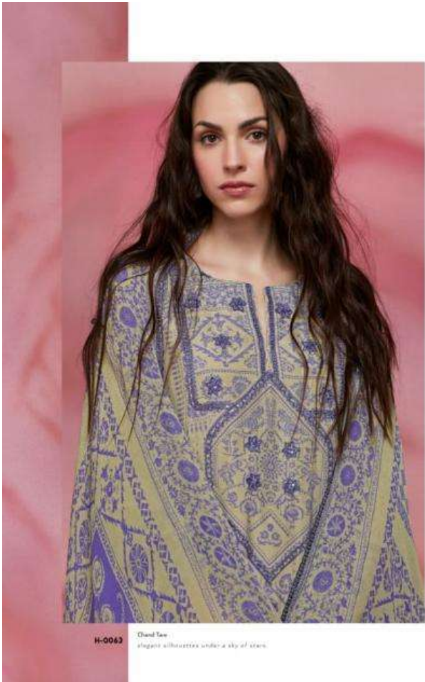
H-0063 Chand Tar elegant silhouettes under a sky of stars.