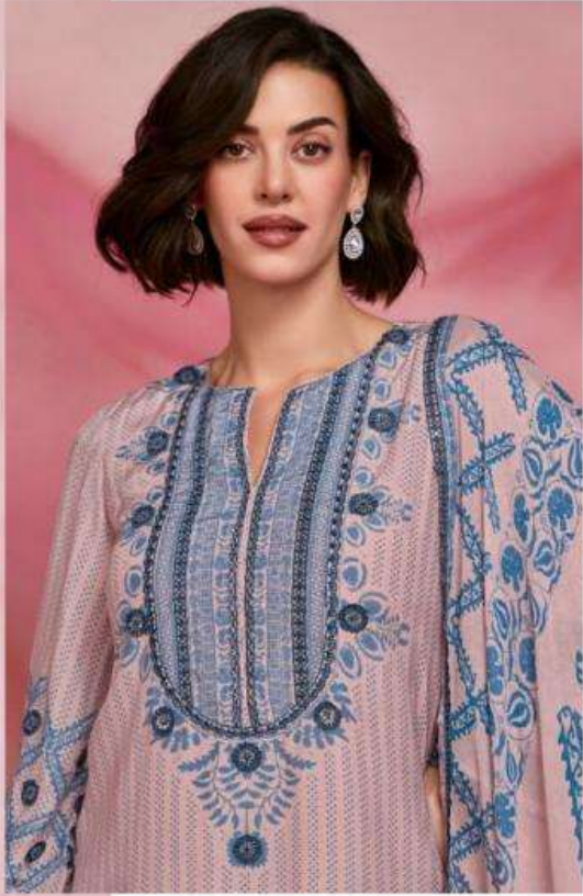
H-0064 Chand Tara a blend of cultural beauty and summer ease.