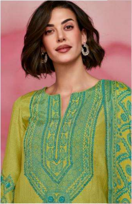
Chand Tare mashriq algharbiy saray inta afillika summer alha.anton.