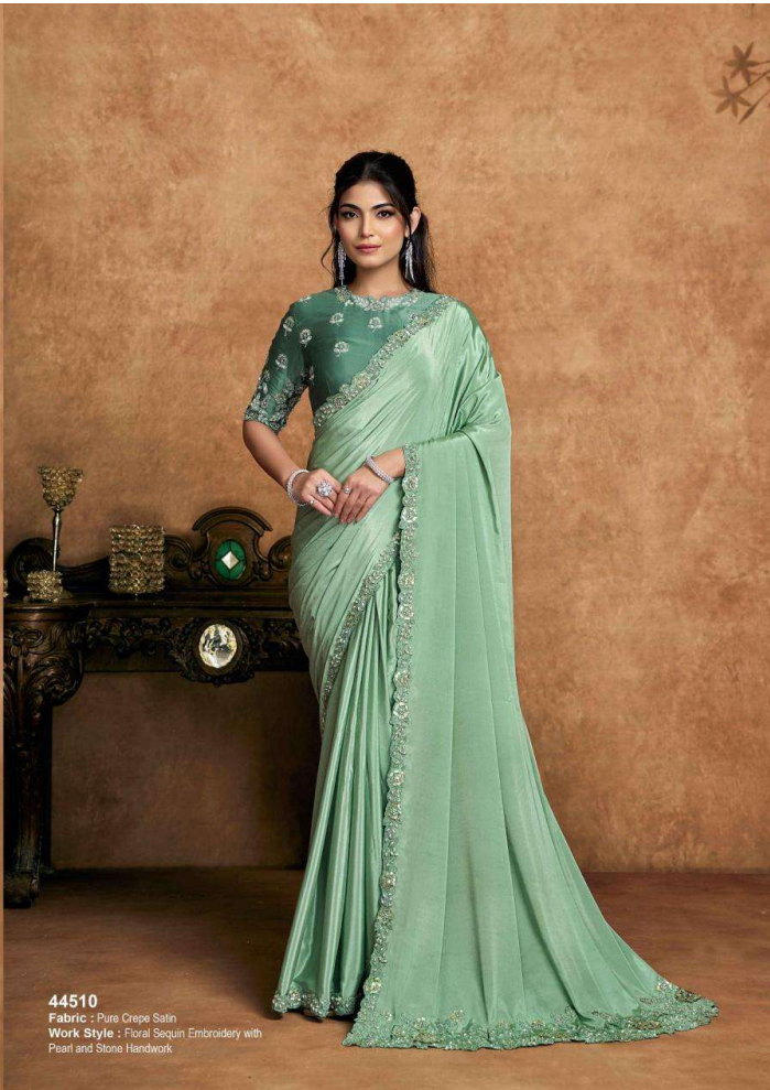
44510 Fabric : Pure Crepe Satin Work Style : Floral Sequin Embroidery with Pearl and Stone Handwork