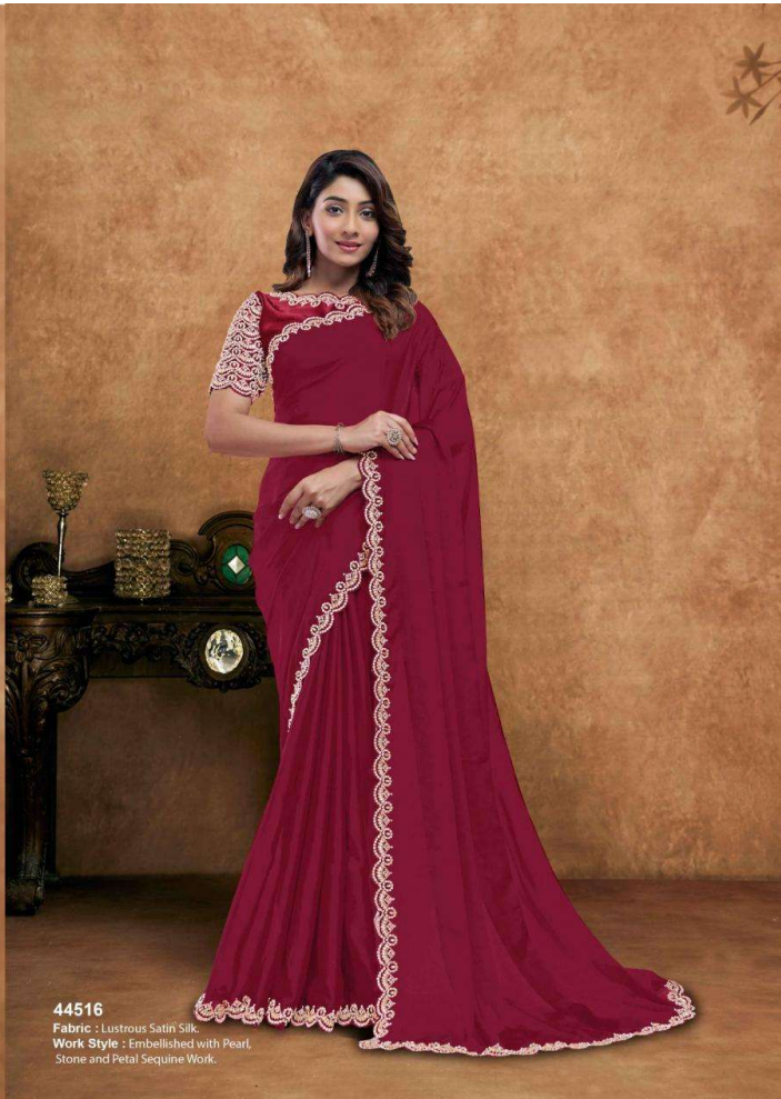
44516 Fabric : Lustrous Satin Silk Work Style : Embellished with Pearl, Stone and Petal Sequine Work.