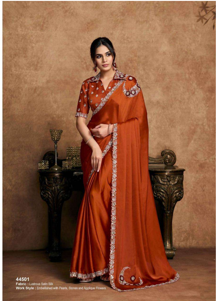
44501 Fabric : Lustrous Satin Silk Work Style : Embellished with Pearls, Stones and Applique Flowers