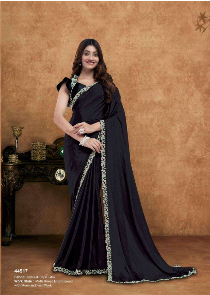
44517 Fabric : Natural Crepe Satin. Work Style : Multi Thread Embroidered with Stone and Pearl Work.