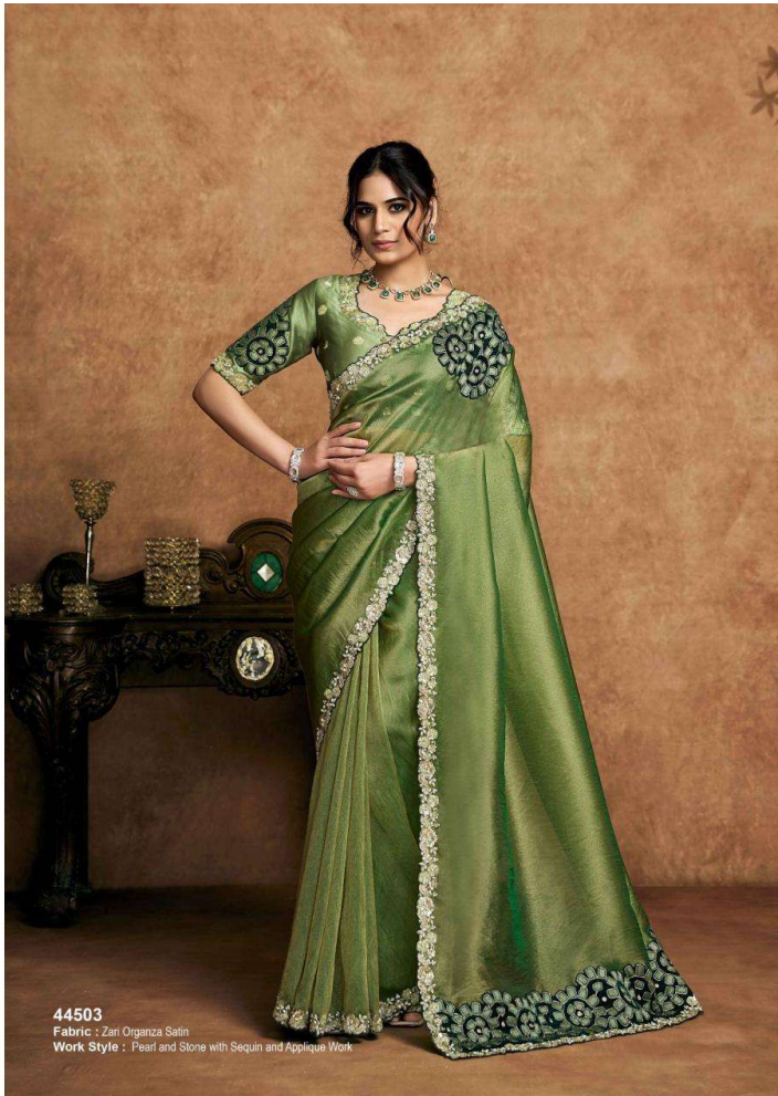
44503 Fabric : Zari Organza Satin Work Style : Pearl and Stone with Sequin and Applique Work