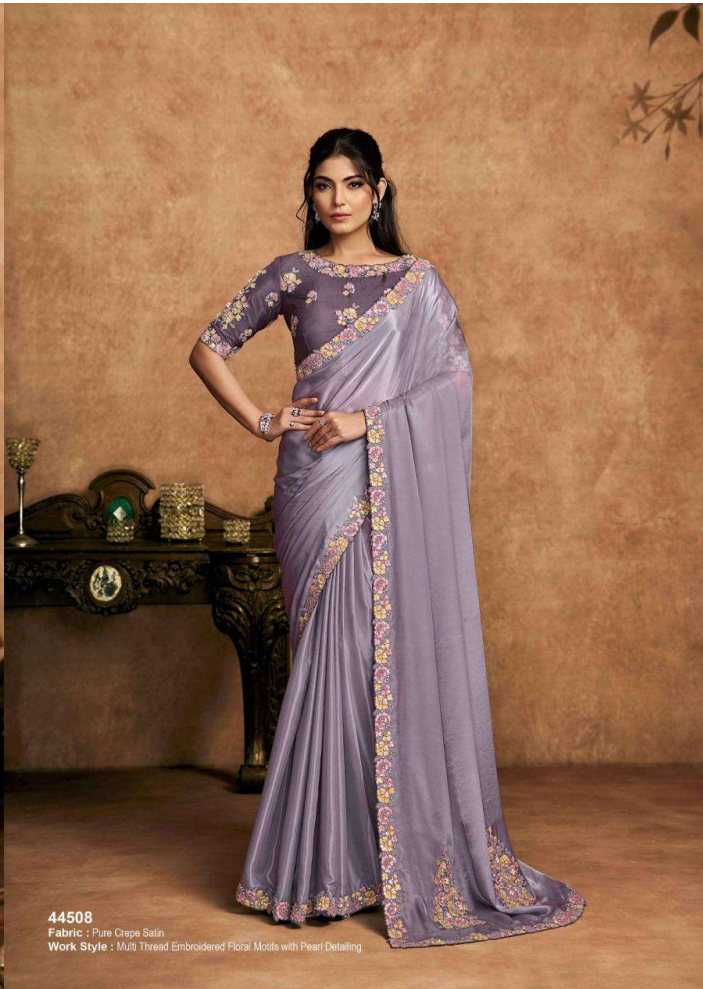
44508 Fabric : Pure Crepe Satin Work Style : Multi Thread Embroidered Floral Motifs with Pearl Detailing