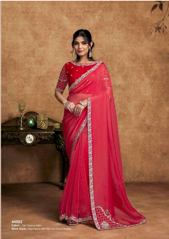
44502 Fabric : Zari Organza Satin Work Style : Dual Sequin with Pearl and Stone Detailing