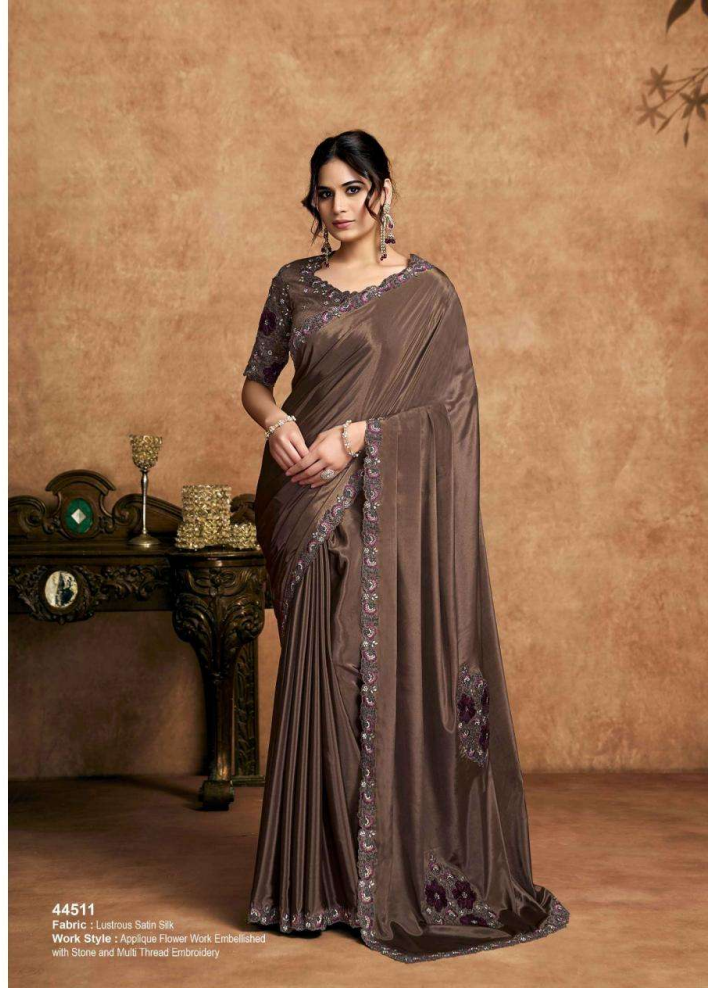
44511 Fabric : Lustrous Satin Silk Work Style : Applique Flower Work Embellished with Stone and Multi Thread Embroidery