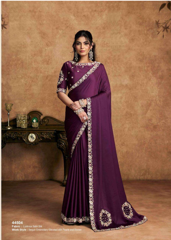
44504 Fabric : Lustrous Satin Silk Work Style : Sequin Embroidery Elevated with Pearls and Stones