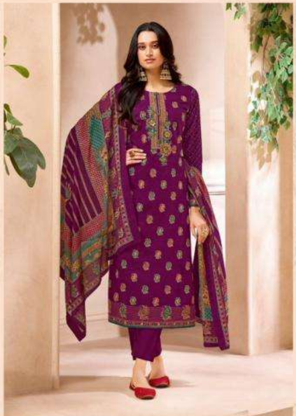
1004 © 2019 S.P. S.