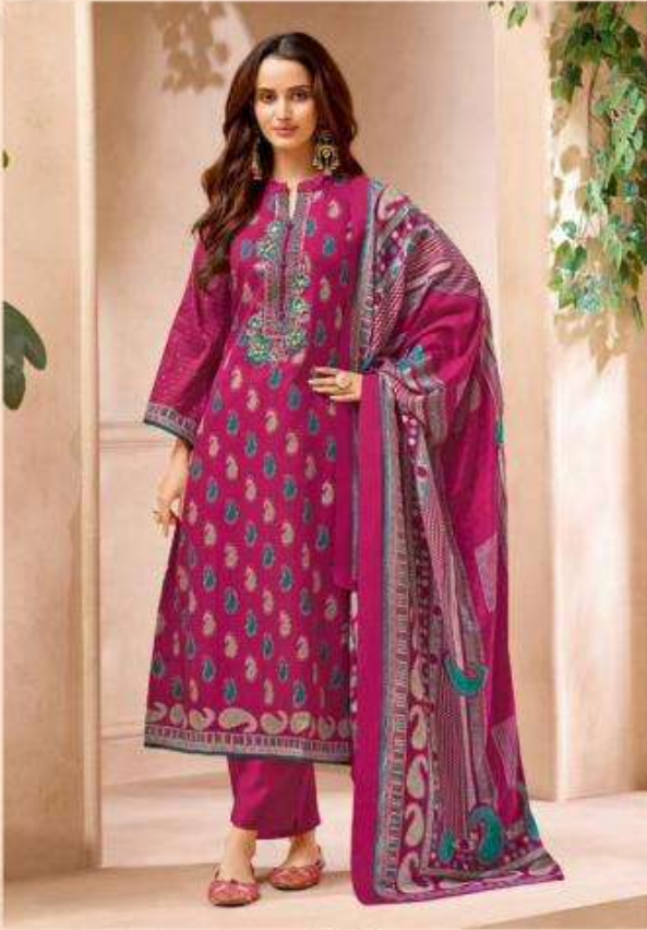
1001 © 2019 S.P. S.