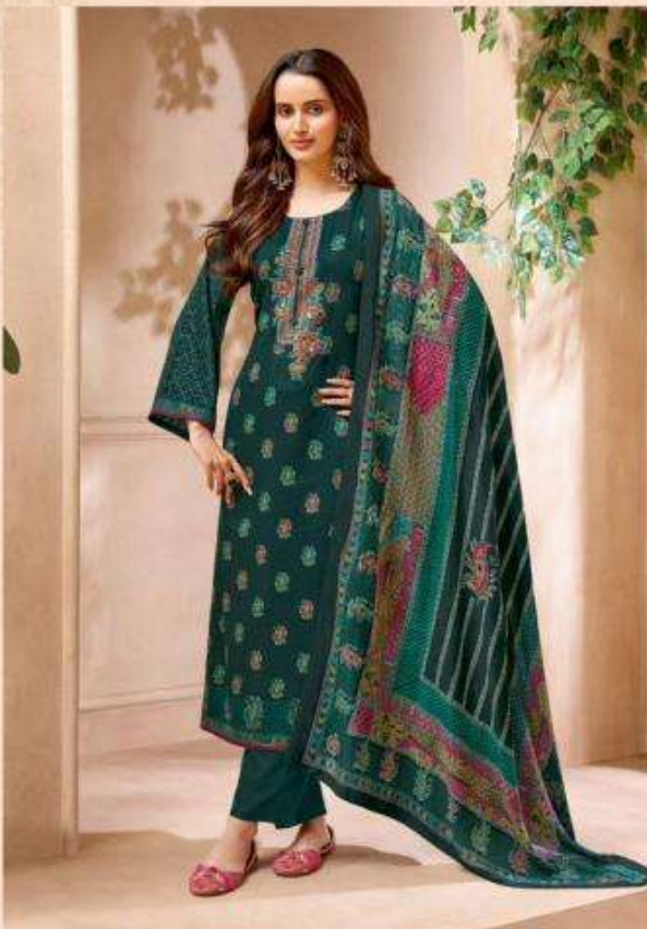
1003 © 2019 S.P. S.