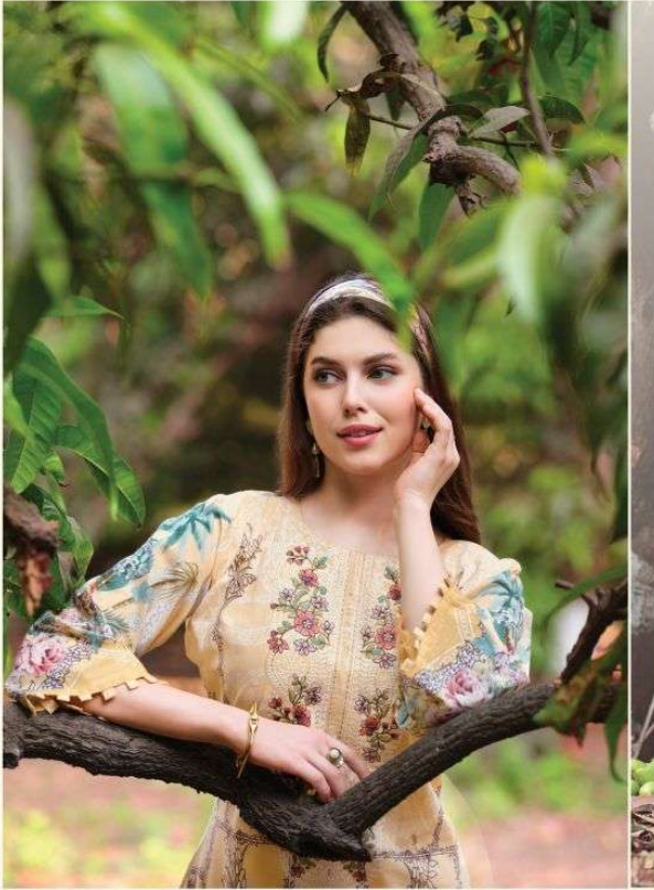
This style is about following trends thoughtfully; it's about understanding who you are and expressing that identity through what you wear, with confidence and authenticity.