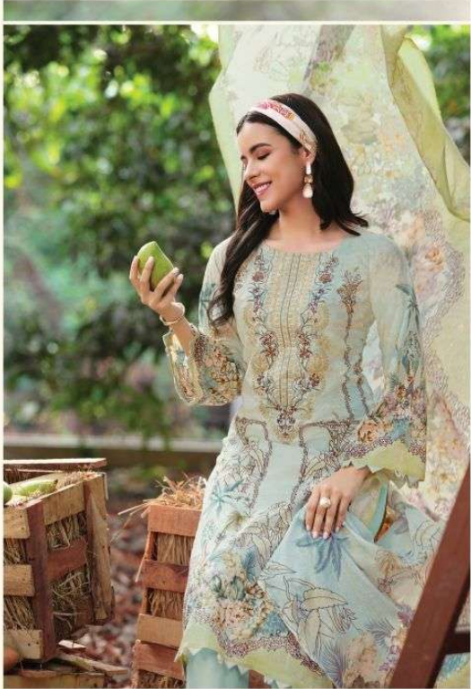
Style is not defined by brands or price tags; it is defined by how you carry yourself, how you combine pieces, and how unapologetically you embrace your individuality.