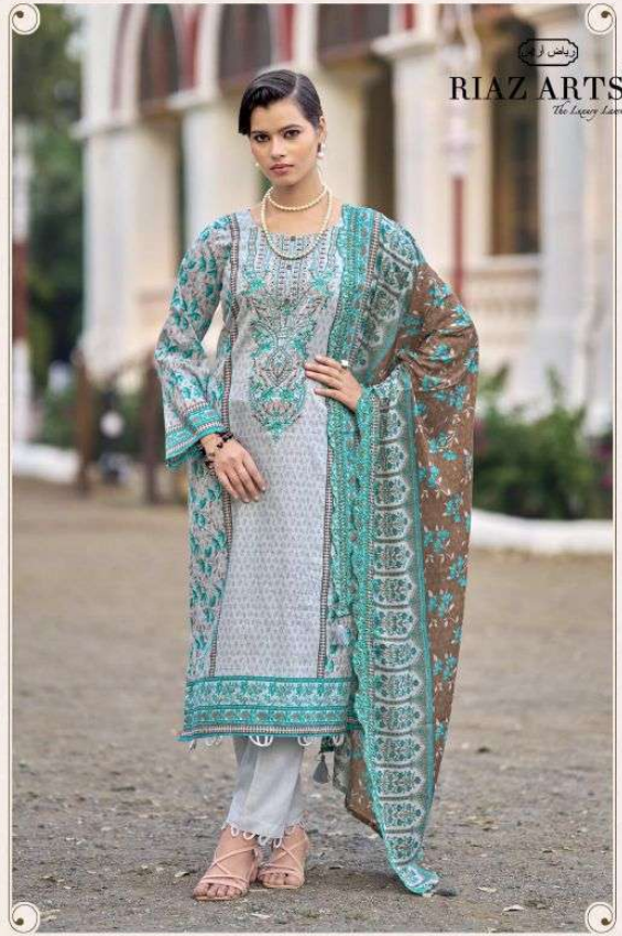
Fuel your ethnic love with embroidery and print detailed dress and make your wardrobe worth investment