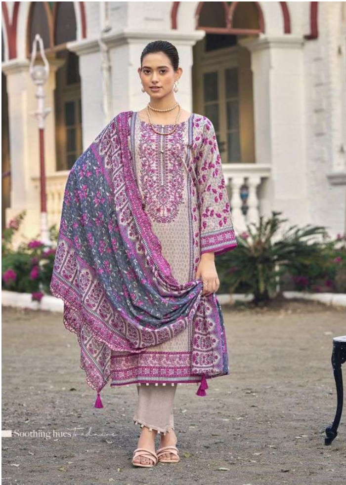
Soothing hues Traditional