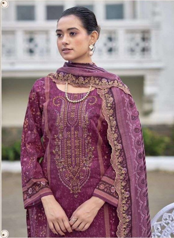
When you see this dress, be assured, it would be the perfect statement piece in the look book.