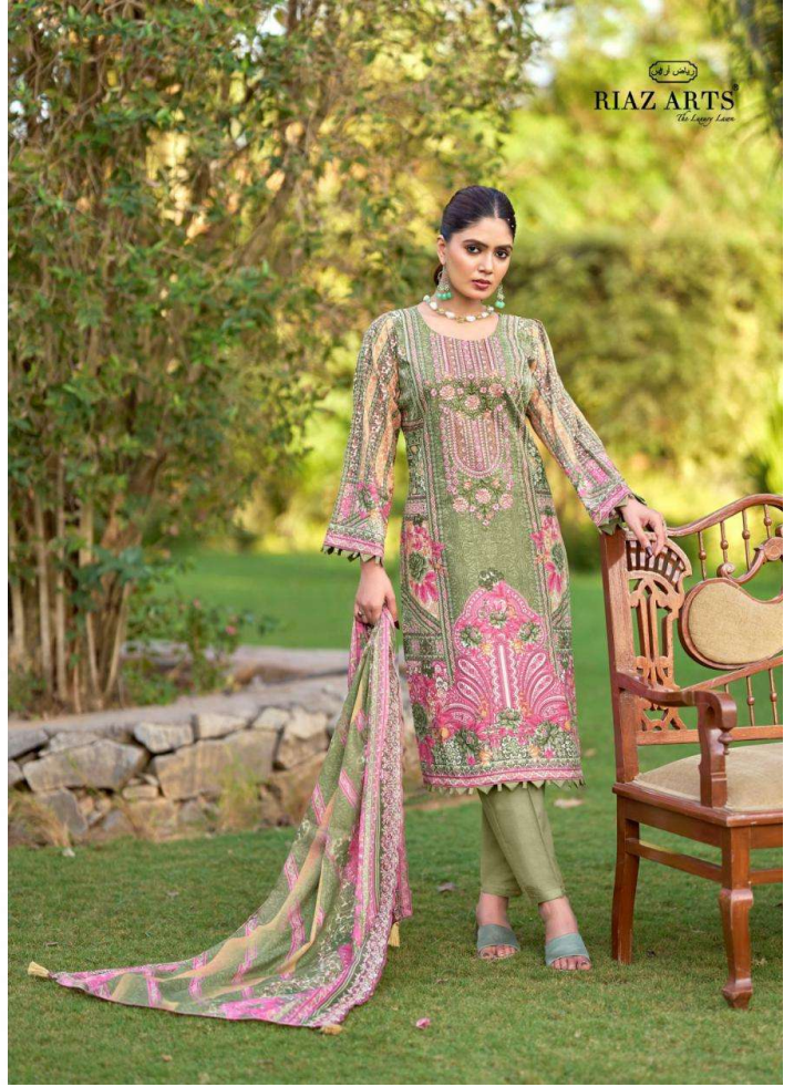
Elegant philosophy ~~~~~ • 1005 •

Celebrate each moment with sparkle and shine.