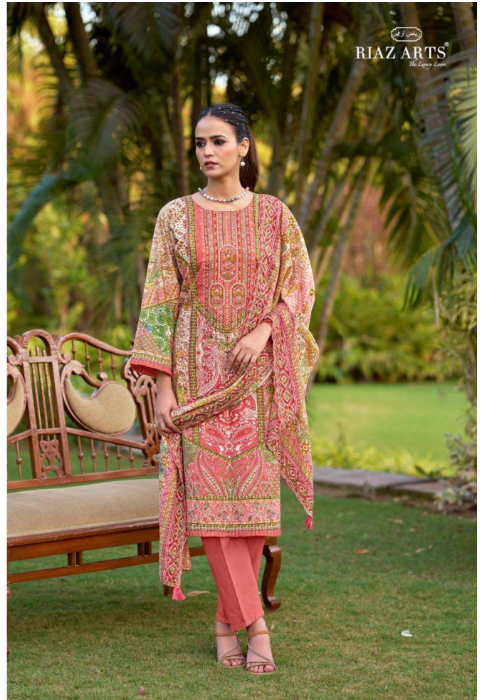
Showcasing an unparalleled collection of season's best fashion trends!