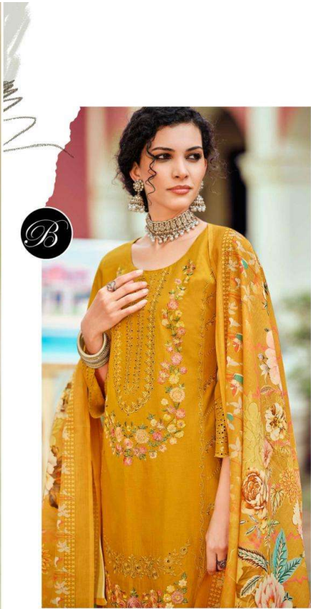
The difference between style and fashion is quality