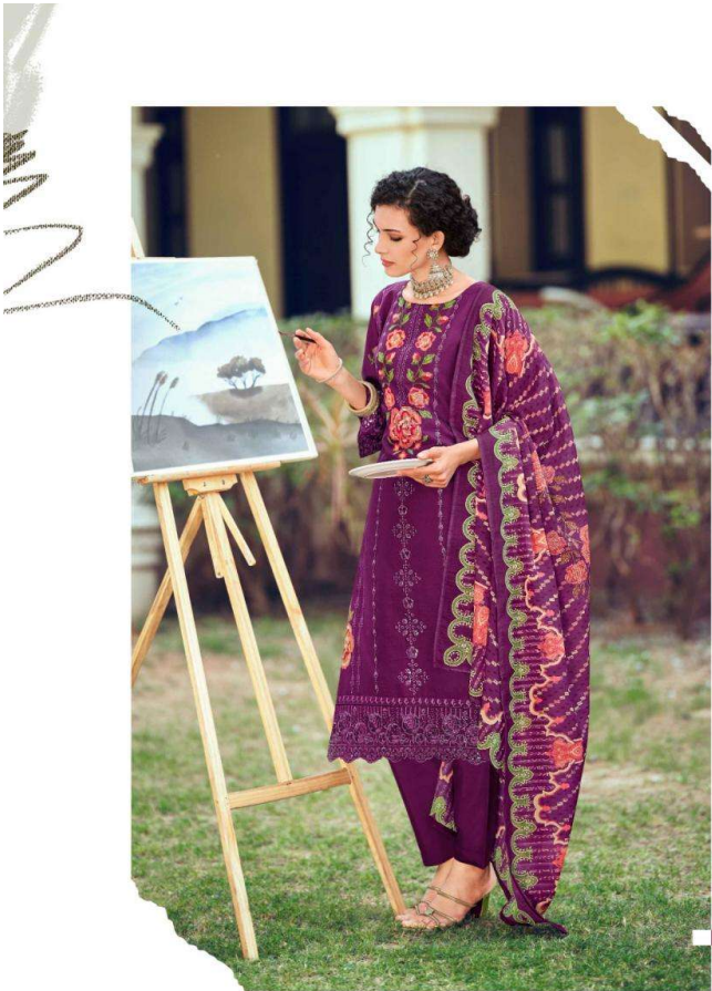
Fashion is architecture. It is a matter of proportion. 889-005