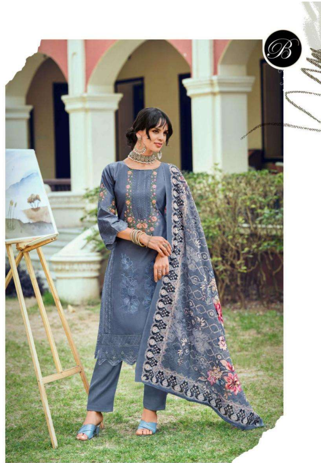
Style is primarily a matter of instinct. 889-004