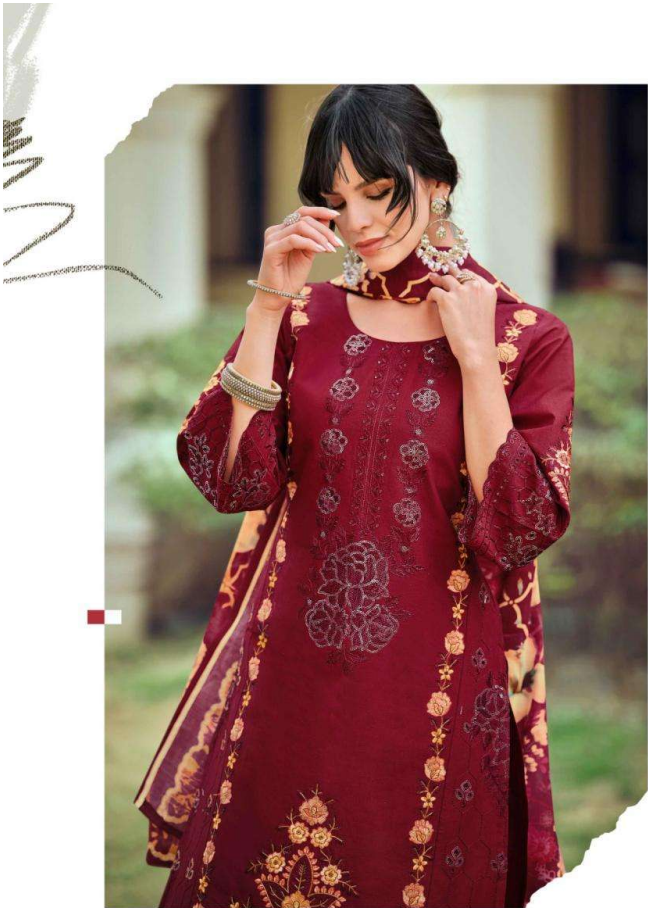
Fashion is architecture. It is a matter of proportion. 889-001