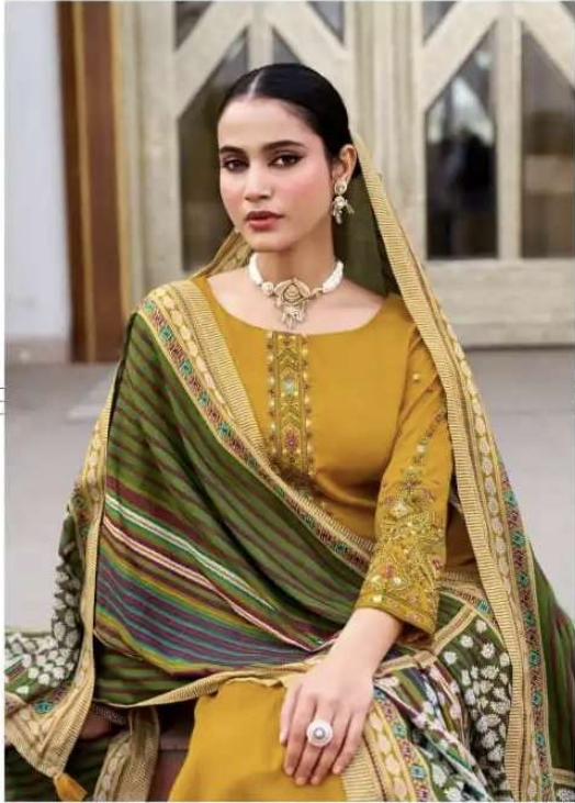
PERFECTED Made for women who notice detail. And value subtlety. • 1004 |

ممتاز آرٹس MUMTAZ ARTS® Purveyors of Design Vrajkala