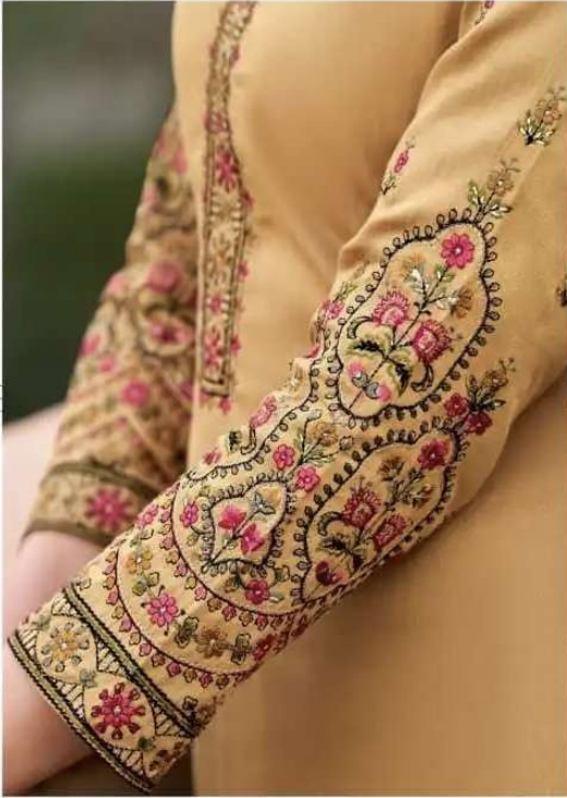
ICONIC Soft textures, deliberate detailing. Luxury expressed with restraint • 1006 |

ممتاز آرٹس MUMTAZ ARTS® Purveyors of Elegance Vrajkala