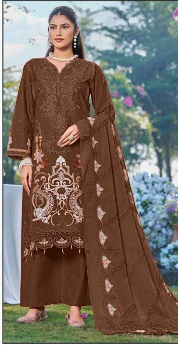
D NO 27002 A