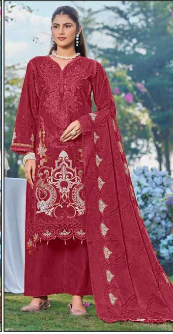
D NO 27002 B