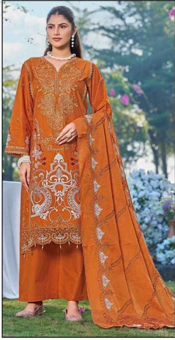
D NO 27002