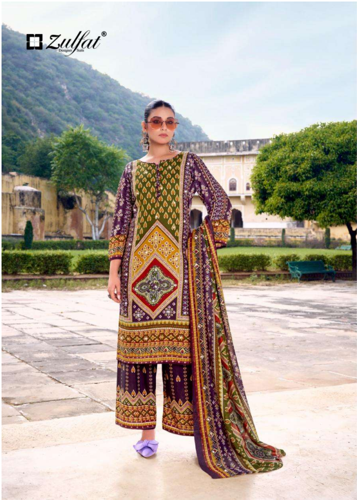
A fabric that is so serene as well as a cliché epitome of global Indian woman.