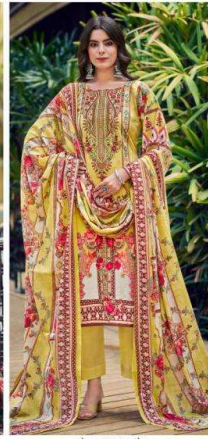
❖ 1002 ❖