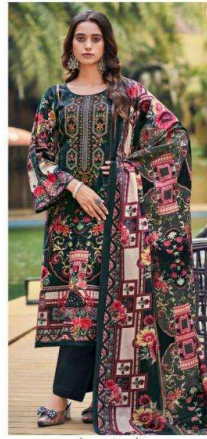
❖ 1001 ❖