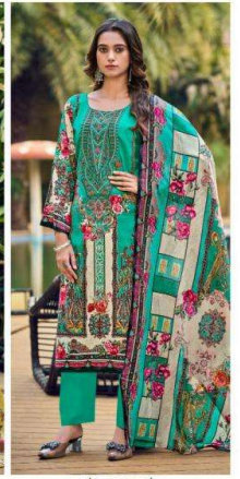
❖ 1003 ❖