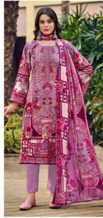
❖ 1004 ❖