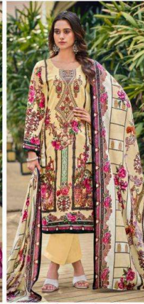
❖ 1005 ❖