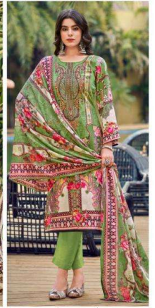
❖ 1006 ❖