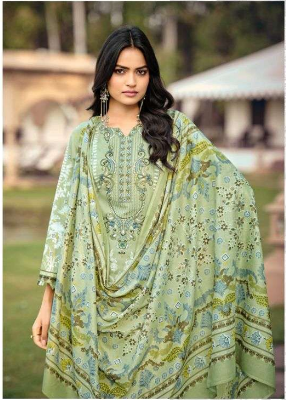
◆◆◆ Enjoy the dainty detail while you adorn this suit set with dupatta. ◆◆◆