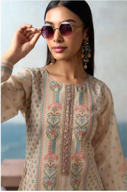
6703 | GOLDEN HOUR: PERFECT FOR WARM, SUNSET-LIT PHOTOS.