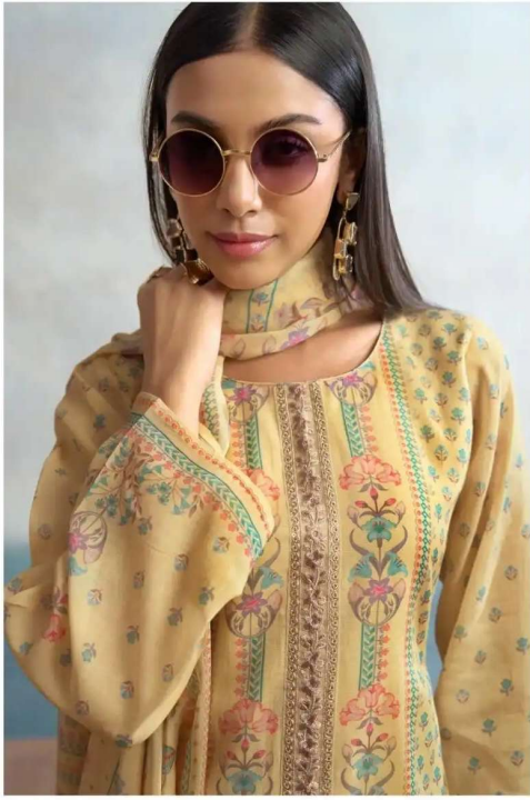
6701 | THE LOOK: CLASSIC AND STRAIGHTFORWARD.