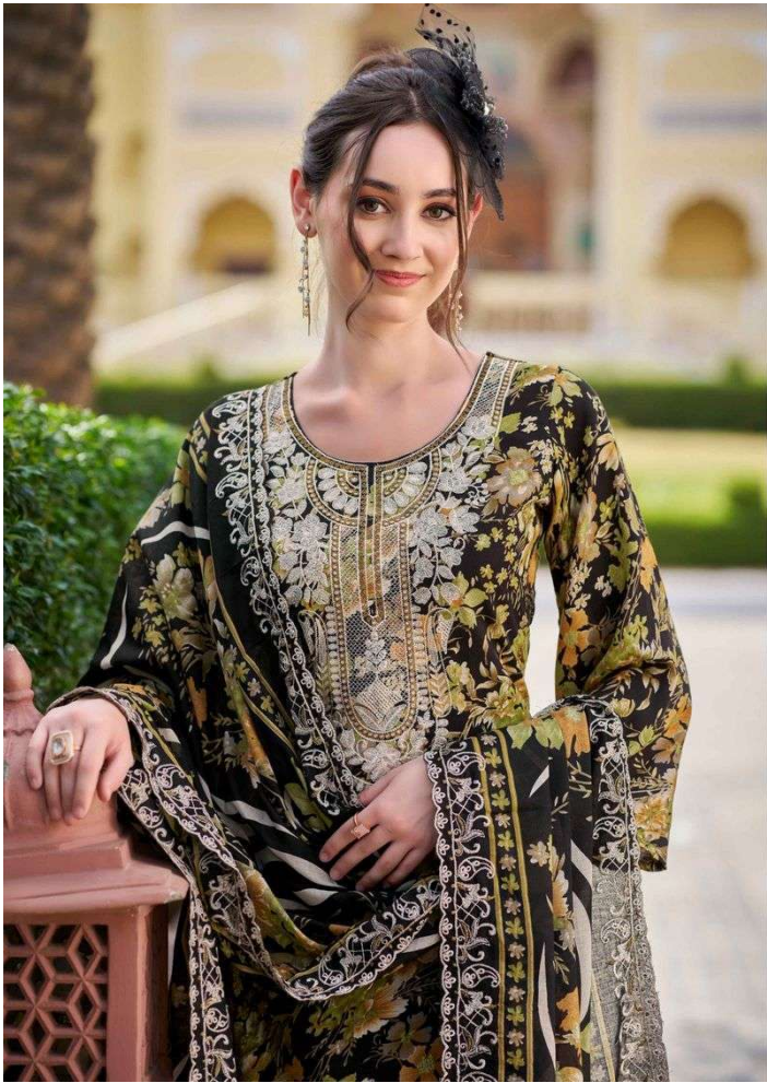
Threads of tradition woven with today's soul.