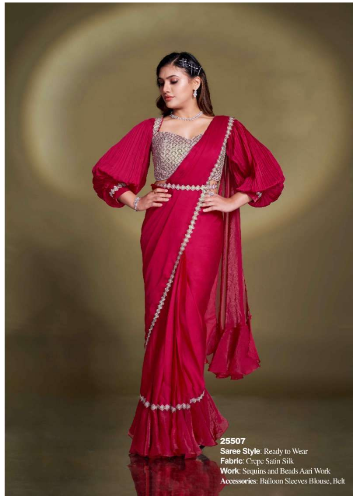
25507 Saree Style: Ready to Wear Fabric: Crepe Satin Silk Work: Sequins and Beads Aari Work Accessories: Balloon Sleeves Blouse, Belt