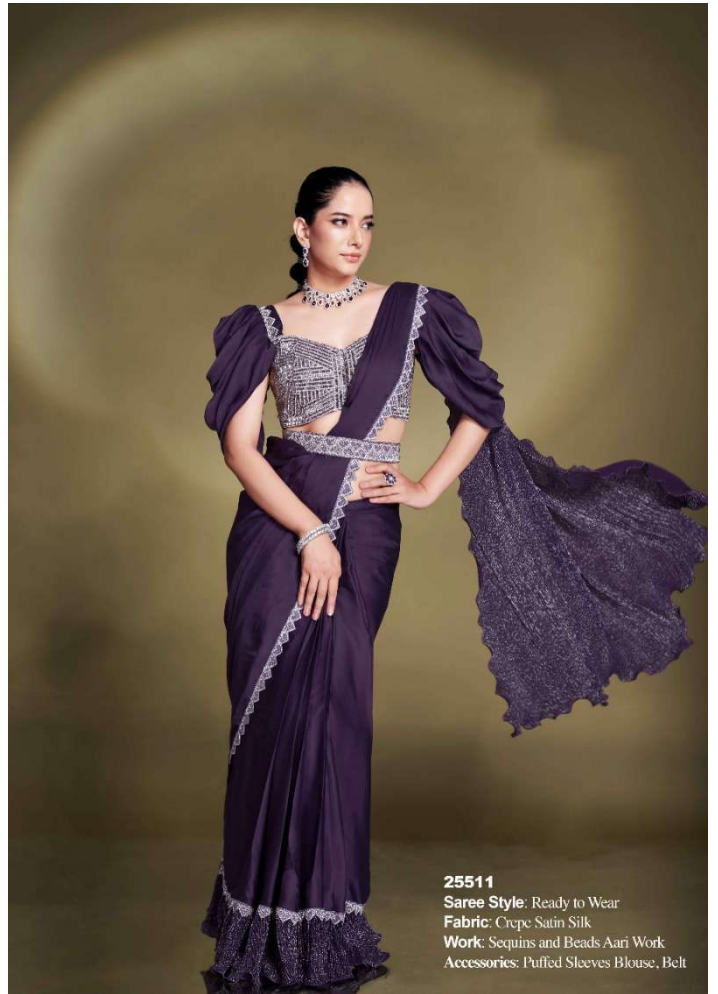
25511 Saree Style: Ready to Wear Fabric: Crepe Satin Silk Work: Sequins and Beads Aari Work Accessories: Puffed Sleeves Blouse, Belt