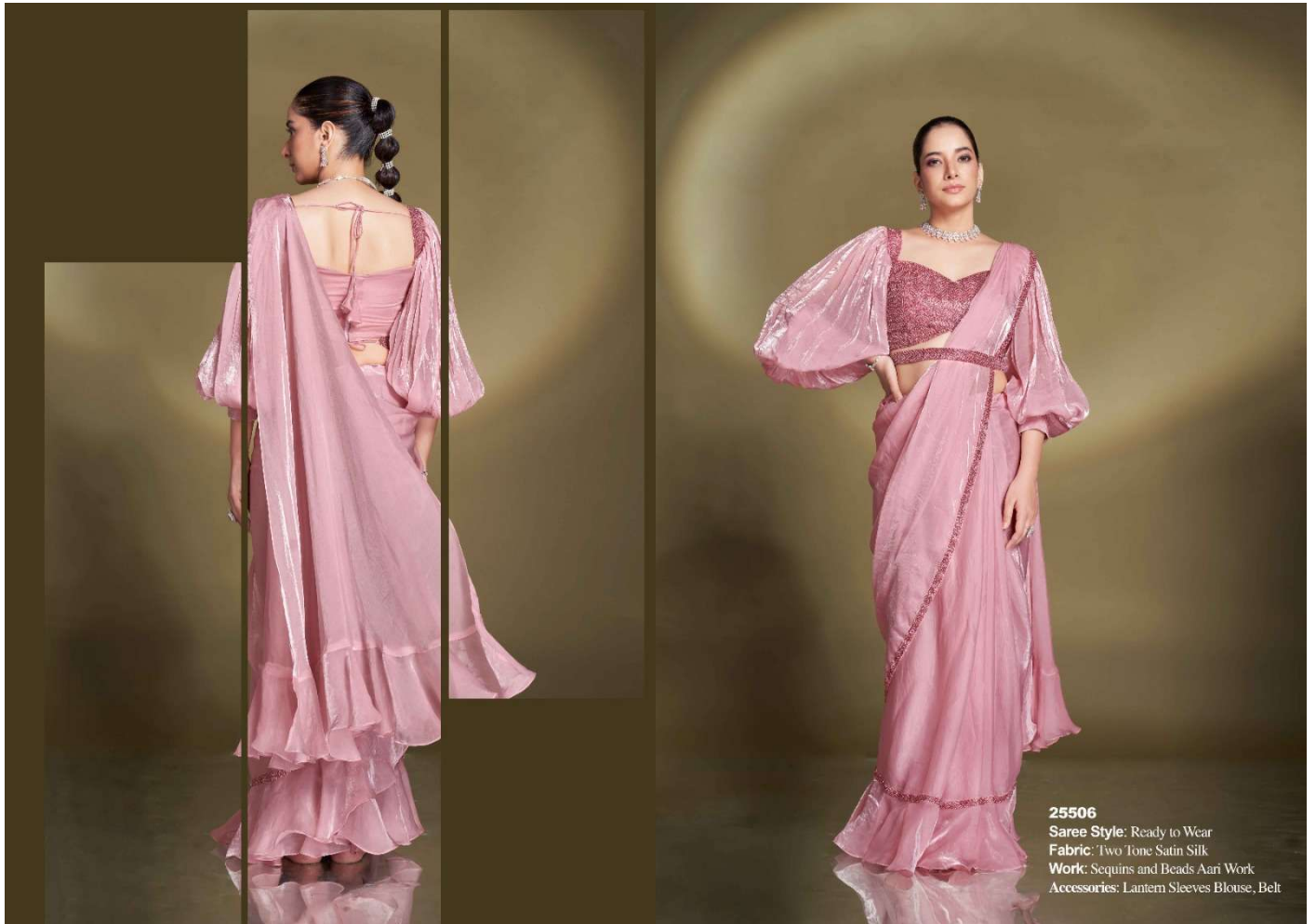
25506 Saree Style: Ready to Wear Fabric: Two Tone Satin Silk Work: Sequins and Beads Aari Work Accessories: Lantern Sleeves Blouse, Belt