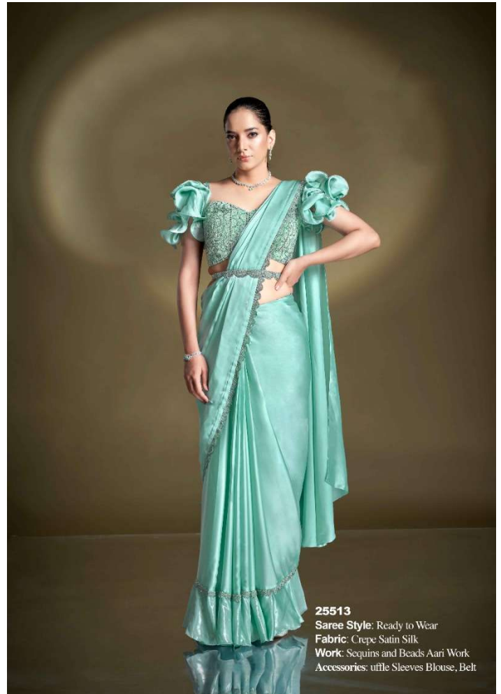
25513 Saree Style: Ready to Wear Fabric: Crepe Satin Silk Work: Sequins and Beads Aari Work Accessories: tulle Sleeves Blouse, Belt