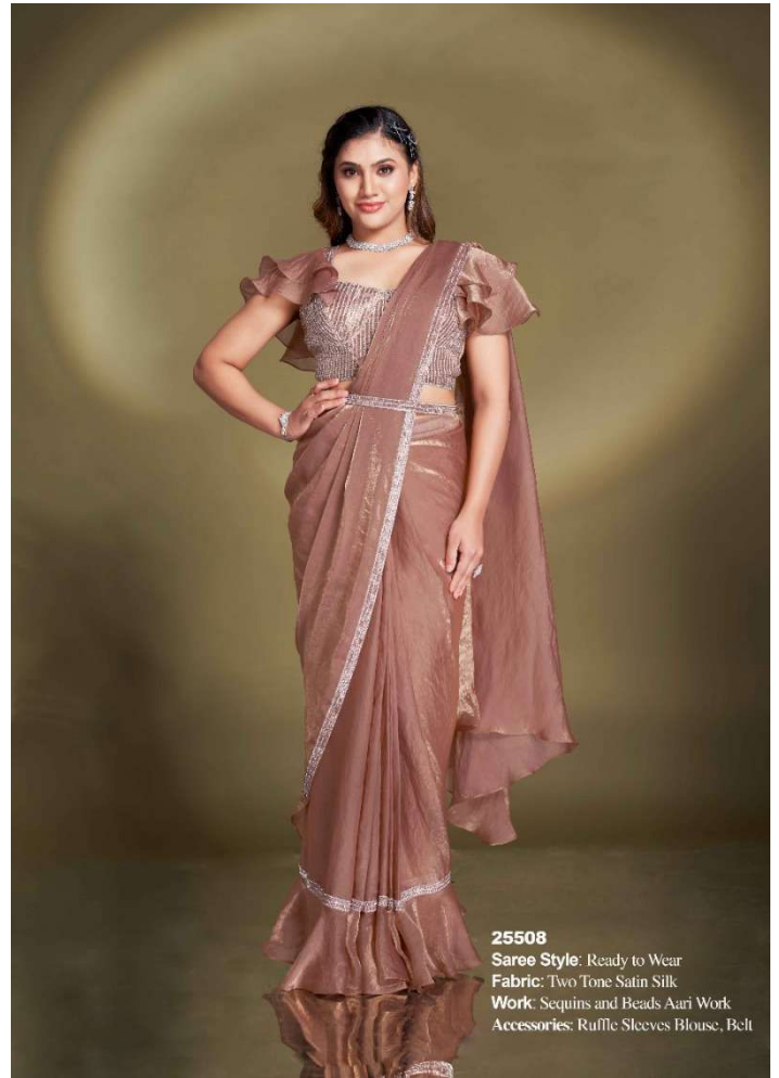
25508 Saree Style: Ready to Wear Fabric: Two Tone Satin Silk Work: Sequins and Beads Aari Work Accessories: Ruffle Sleeves Blouse, Belt