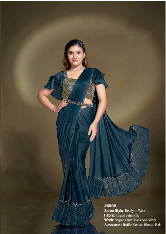
25509 Saree Style: Ready to Wear Fabric: Crepe Satin Silk Work: Sequins and Beads Aari Work Accessories: Ruffle Sleeves Blouse, Belt