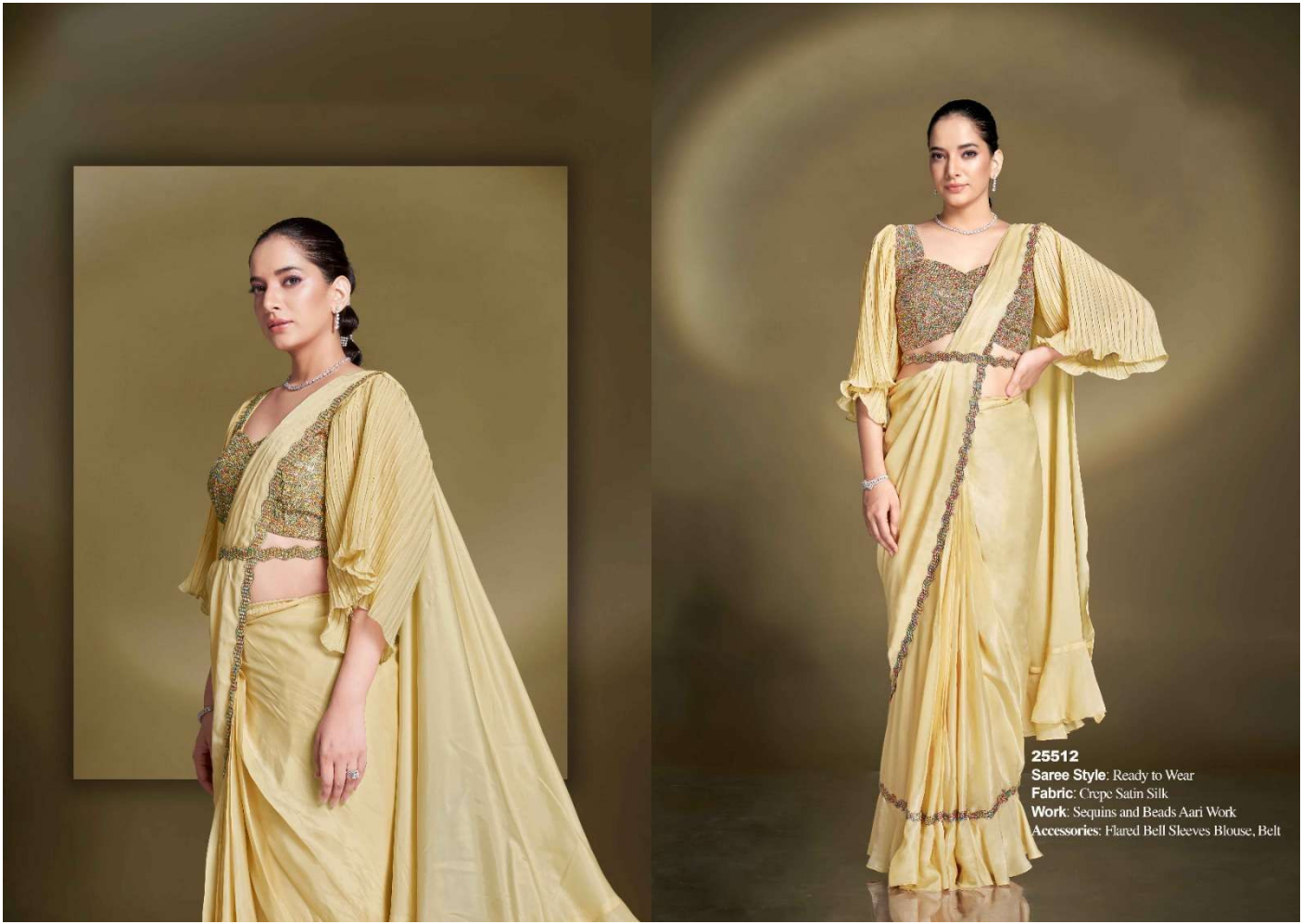
25512 Saree Style: Ready to Wear Fabric: Crepe Satin Silk Work: Sequins and Beads Aari Work Accessories: Flared Bell Sleeves Blouse, Belt