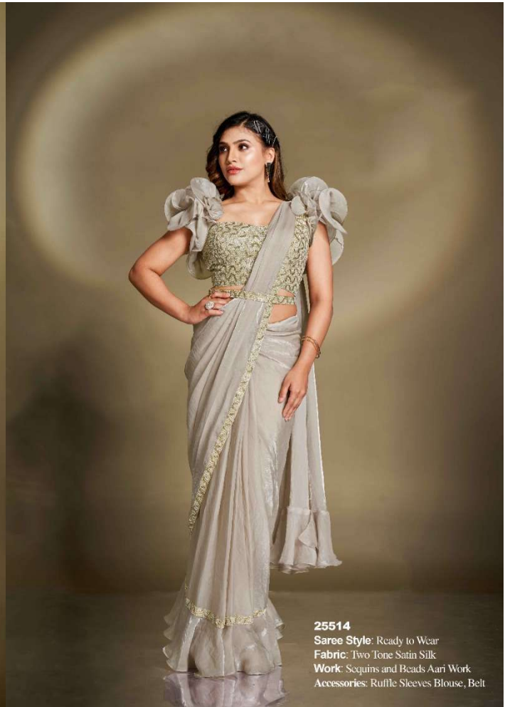
25514 Saree Style: Ready to Wear Fabric: Two Tone Satin Silk Work: Sequins and Beads Aari Work Accessories: Ruffle Sleeves Blouse, Belt