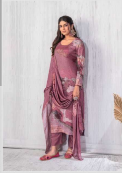
Barkha 9075 A