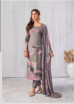
Barkha 9075 B