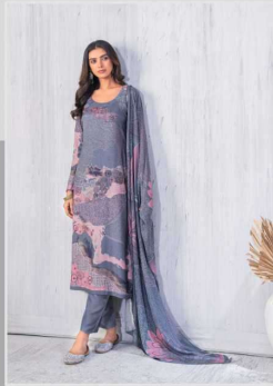
Barkha 9075 D

*** Draped in Heritage, Styled with Grace ***