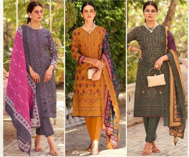
D.No. 2004 ***