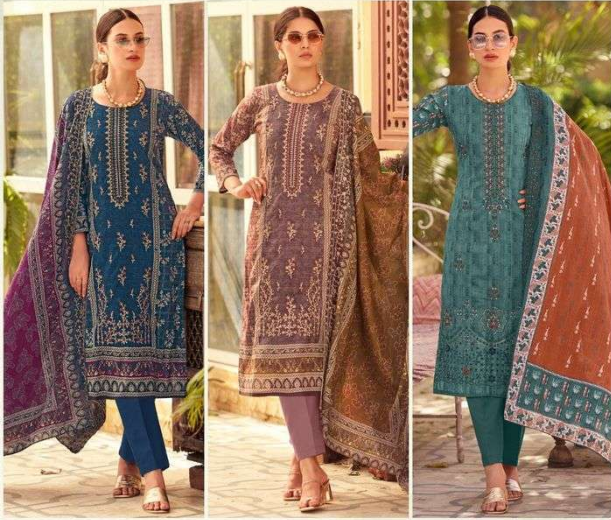
D.No. 2001 ***