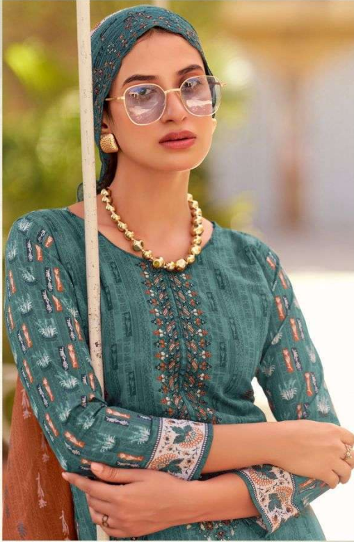
Enchanting charm, beauty beyond the stars!