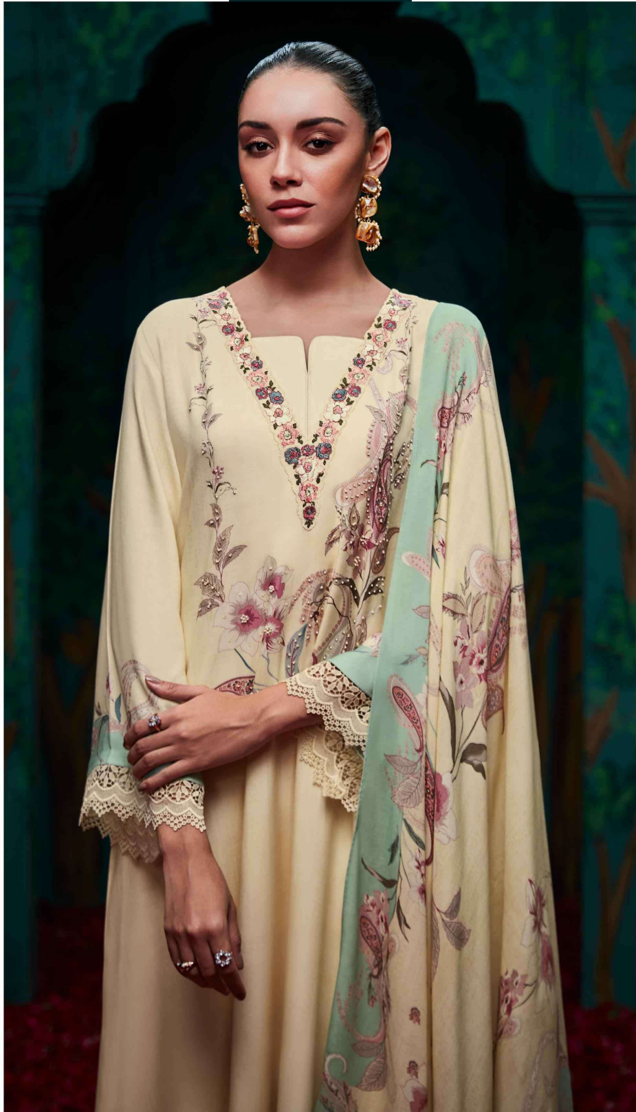
Minimal and delicate work detail lends you an elegant and urbane look to astonish occasion.