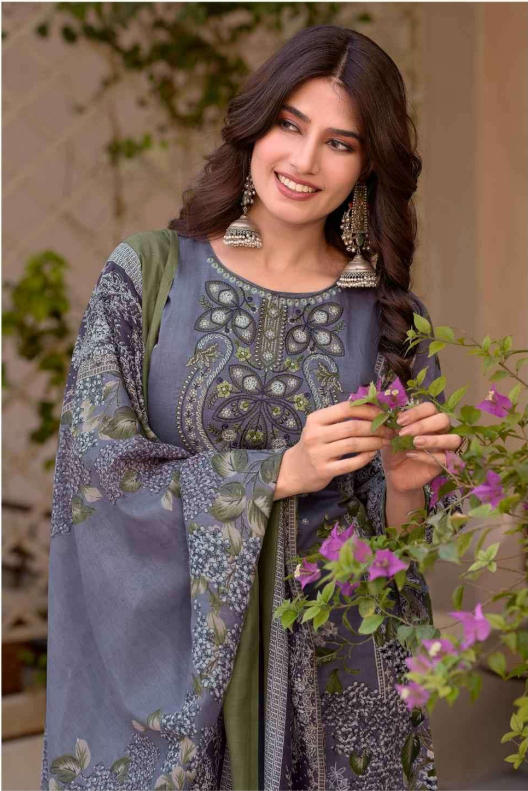
you will find this season's fabrics are soocially with spirit and style to your wardrobe! a masterfully printed shiff, exotically pat trenced pallu with sophisticated plain desigus.