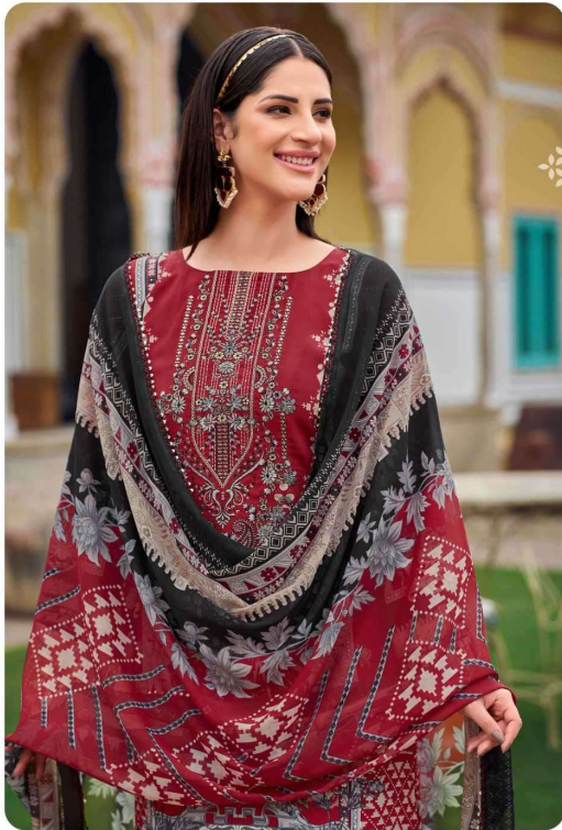
CULTURAL HERITAGE :