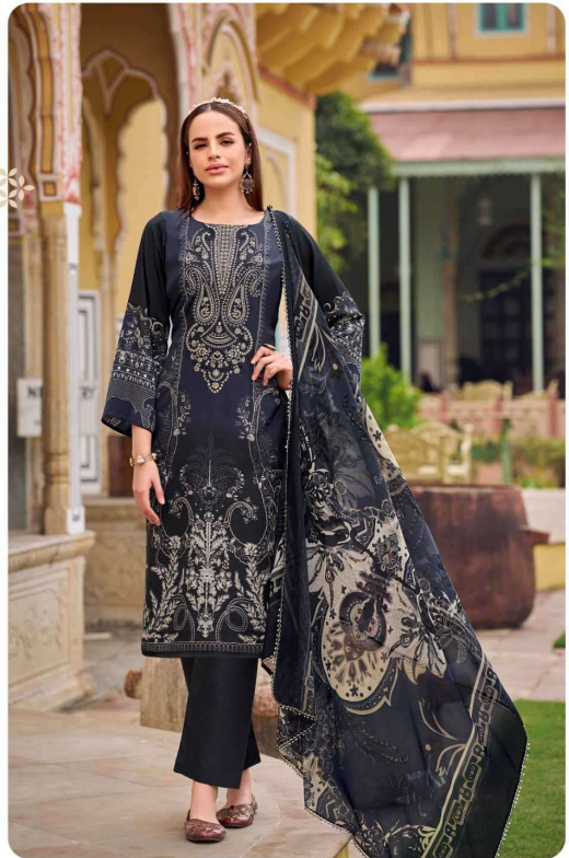
SPARK AND SHINE