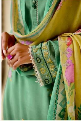
STYLE STATEMENT 201