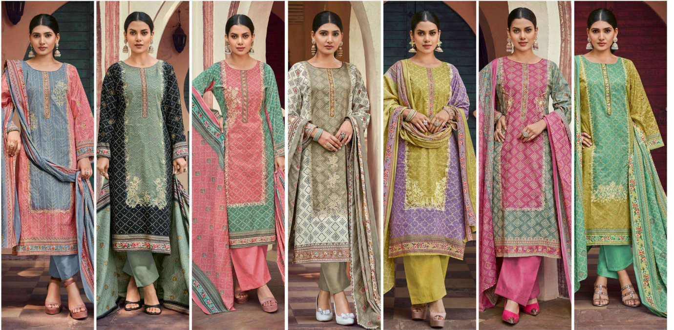
• 1001 •