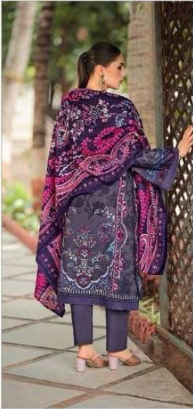
گلزار و گلشن | 27007