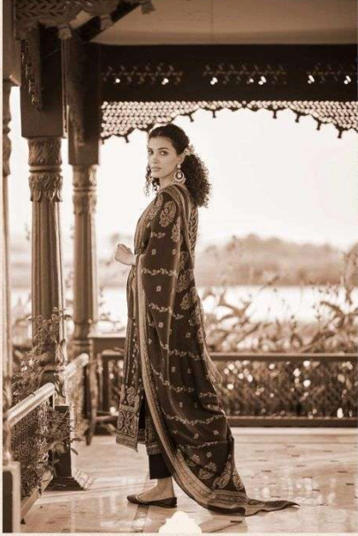
Fashion dress styles blend modern elements with traditional aesthetics adapting to changing fashion trends.

ممتاز آرٹس MUMTAZ ARTS Purveyors of Elegance