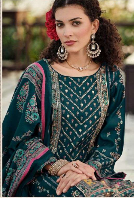
Learning to drape a dress is an art with different regions having their own draping styles.

ممتاز آرٹس MUMTAZ ARTS Purveyors of Elegance