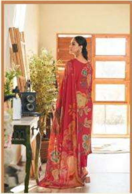
8017-A Designed by the STIMAR®