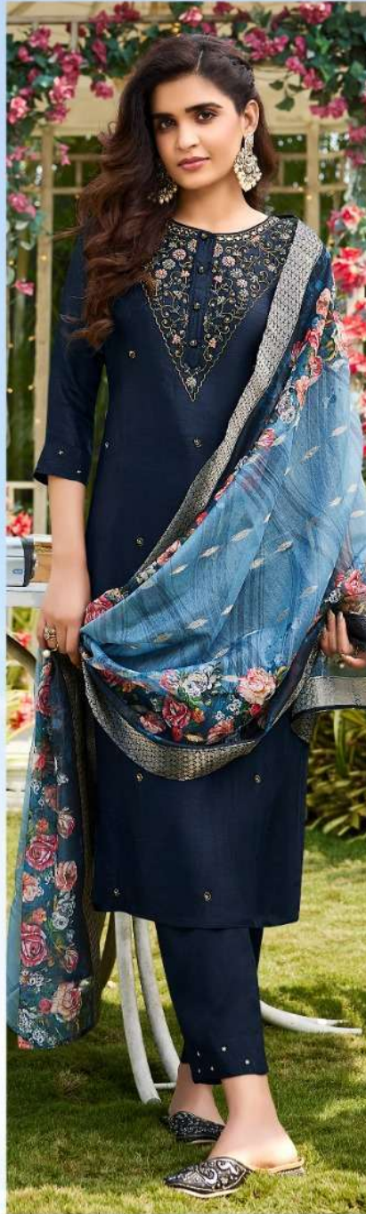
Ghunghat VOL-12 4105