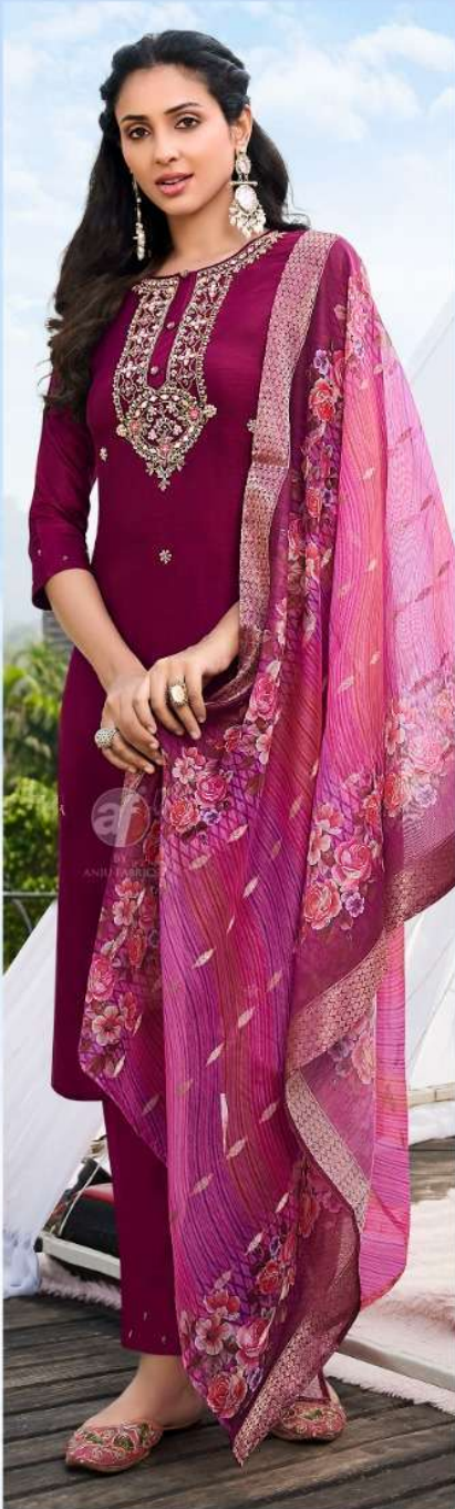
Ghunghat VOL-12 4104