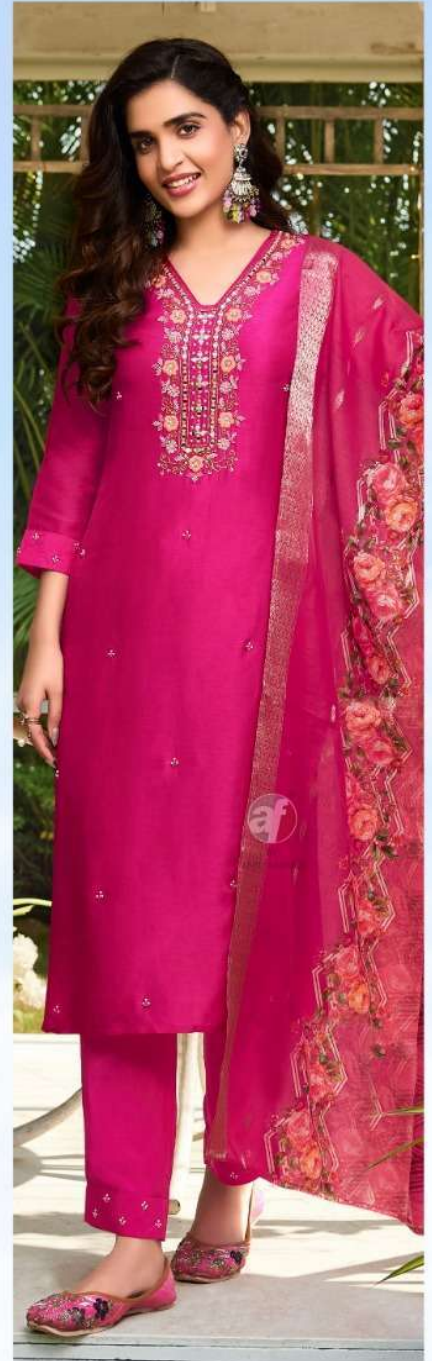
Ghunghat VOL-12 4105