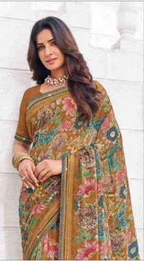
80806 (With stone work)