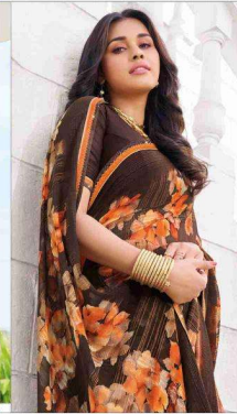
80812 (With stone work)