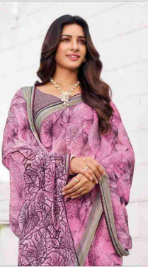
80807 (With stone work)