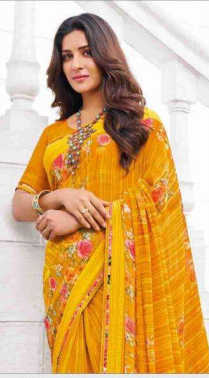
80804 (With stone work)