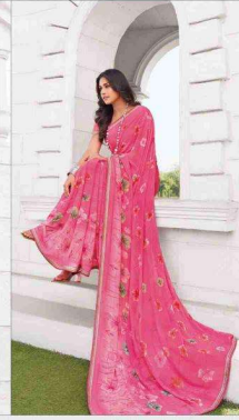
80809 (With stone work)