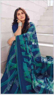
80802 (With stone work)