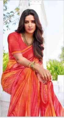
80803 (With stone work)