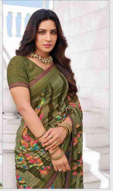
80810 (With stone work)