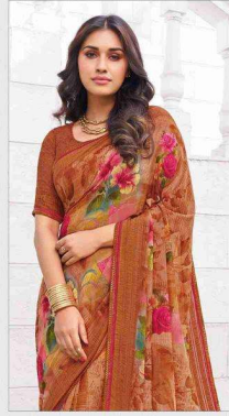
80808 (With stone work)