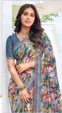
80811 (With stone work)