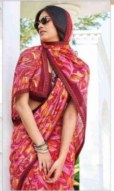
80813 (With stone work)