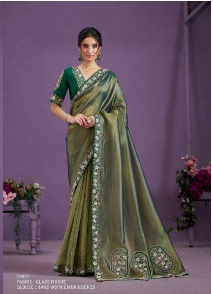
24812 FABRIC : GLASS TISSUE BLOUSE : HAND WORK EMBROIDERED