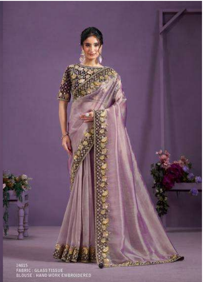
24815 FABRIC : GLASS TISSUE BLOUSE : HAND WORK EMBROIDERED