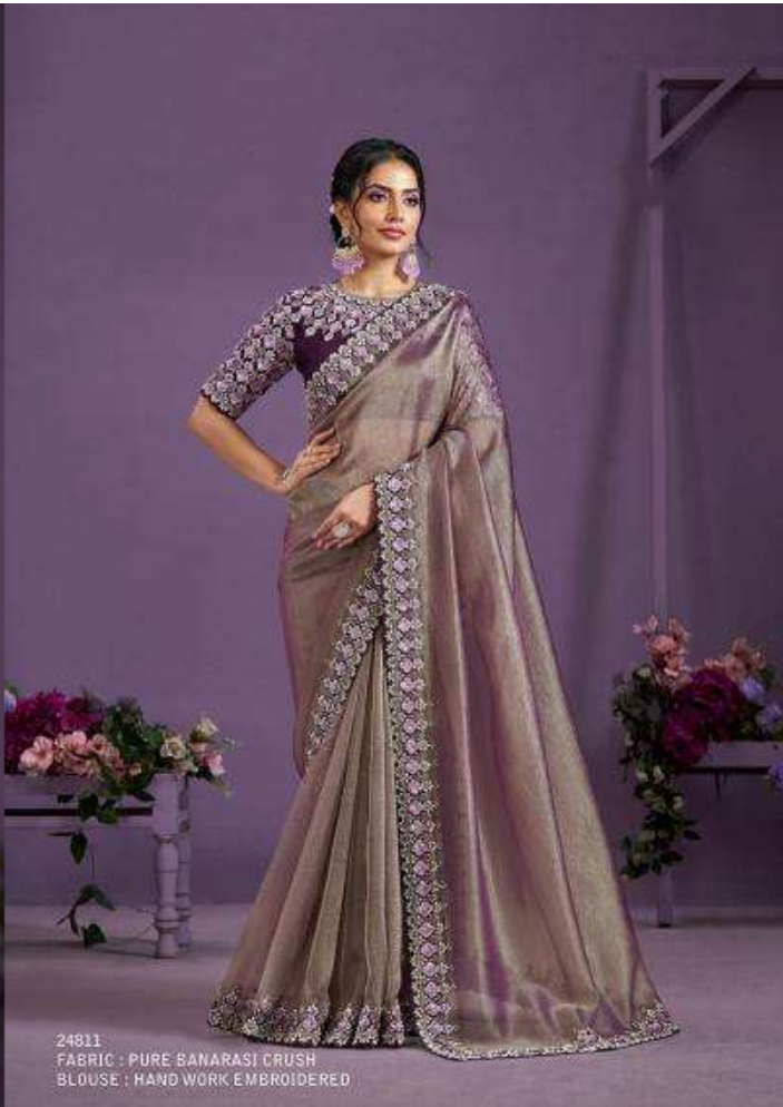
24811 FABRIC : PURE BANARASI CRUSH BLOUSE : HAND WORK EMBROIDERED