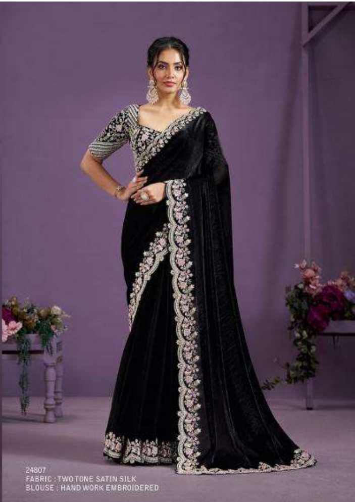
24807 FABRIC : TWO TONE SATIN SILK BLOUSE : HAND WORK EMBROIDERED