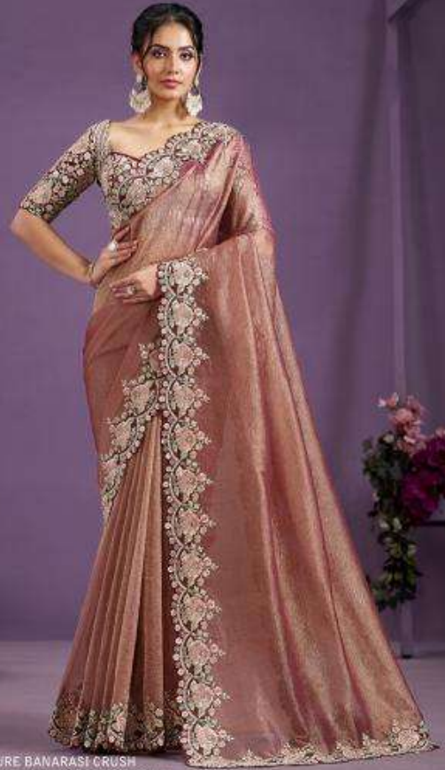
24806 FABRIC : PURE BANARASI CRUSH BLOUSE : HAND WORK EMBROIDERED