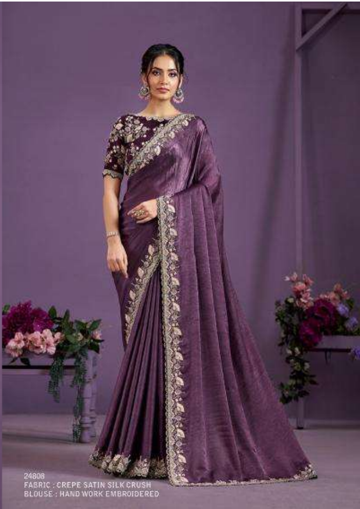
24808 FABRIC : CREPE SATIN SILK CRUSH BLOUSE : HAND WORK EMBROIDERED