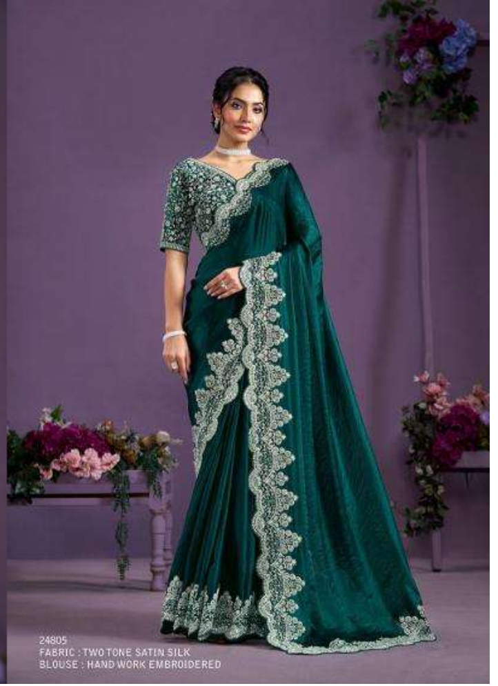
24805 FABRIC : TWO TONE SATIN SILK BLOUSE : HAND WORK EMBROIDERED