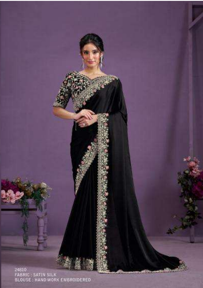
24810 FABRIC : SATIN SILK BLOUSE : HAND WORK EMBROIDERED