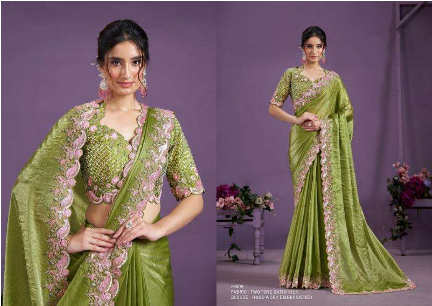
24809 FABRIC : TWO-TONE SATIN SILK BLOUSE : HAND WORK EMBROIDERED