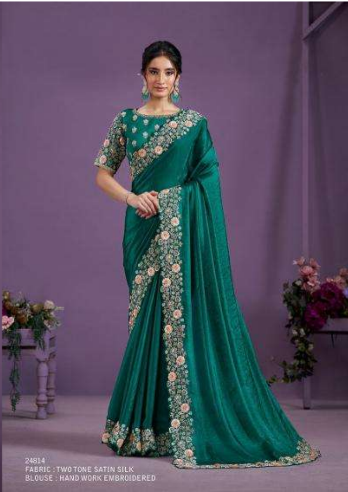
24814 FABRIC : TWO TONE SATIN SILK BLOUSE : HAND WORK EMBROIDERED