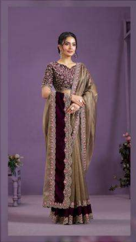
The HEAVY blouses are perfectly DESIGNED to match each SAREE, making sure that every DUETIT LOOKS rich and SOPHISTICATED.