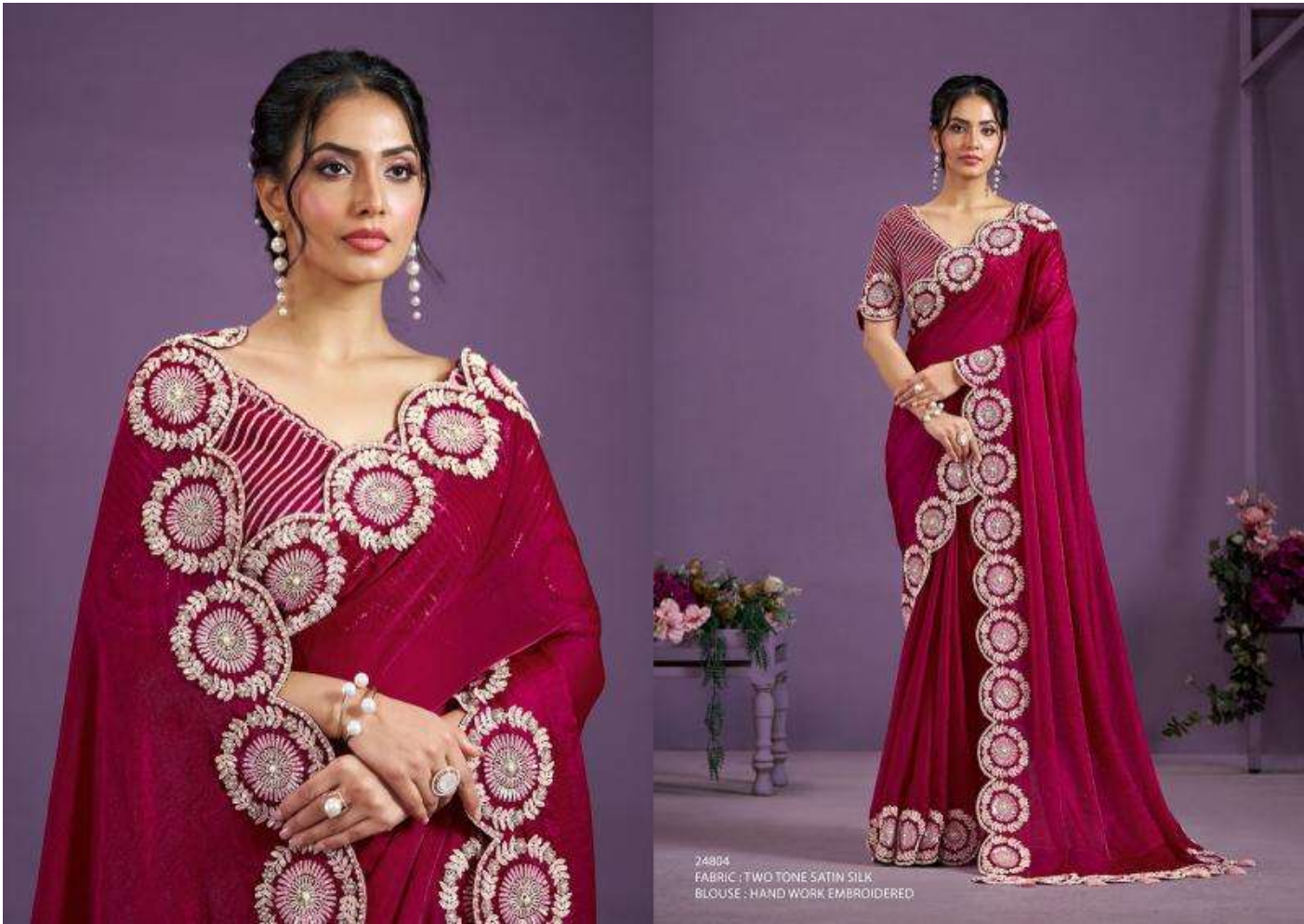
24804 FABRIC : TWO TONE SATIN SILK BLOUSE : HAND WORK EMBROIDERED