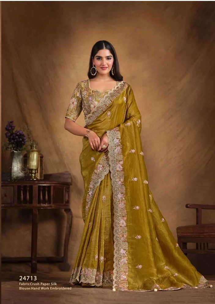
24713 Fabric:Crush Paper Silk Blouse:Hand Work Embroidered