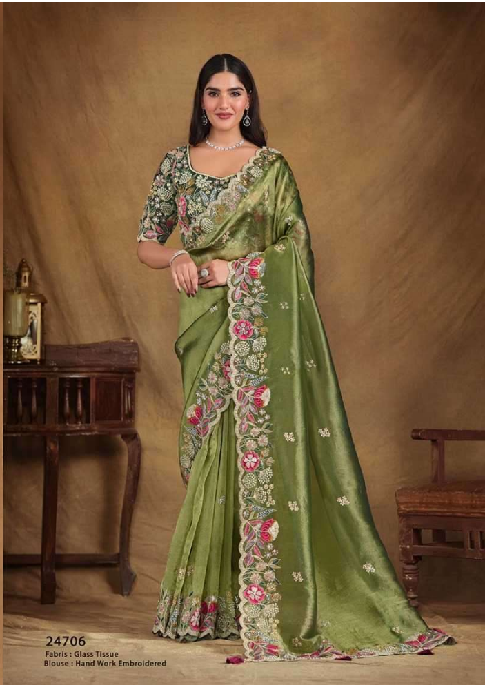
24706 Fabric : Glass Tissue Blouse : Hand Work Embroidered