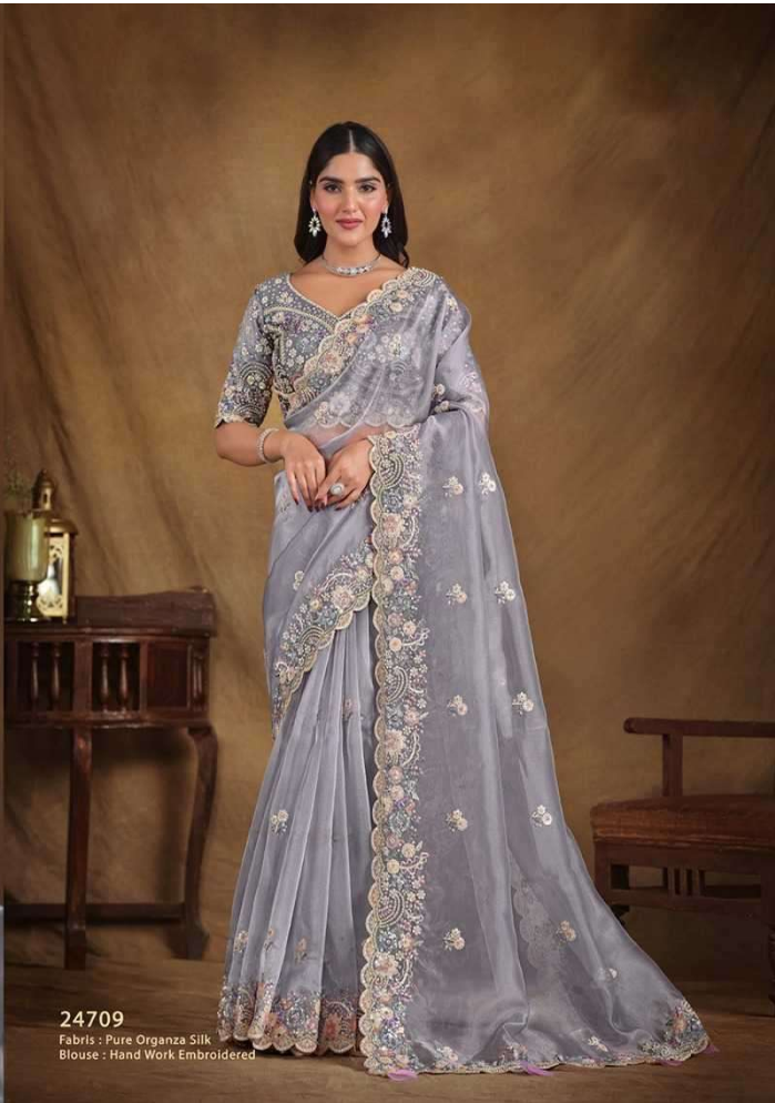
24709 Fabrics : Pure Organza Silk Blouse : Hand Work Embroidered