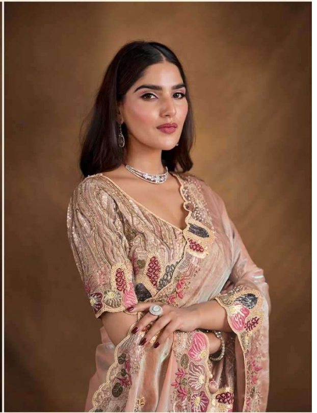
◆◆◆ 24712 Fabric: Two tone Satin Silk Blouse: Hand Work Embroidered