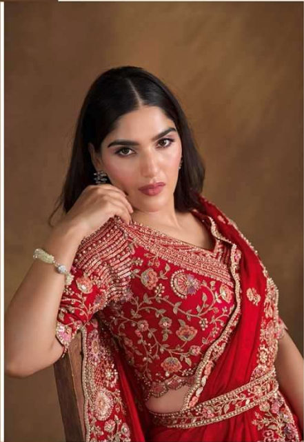
24710 Fabric : Two tone Satin Silk Blouse : Hand Work Embroidered