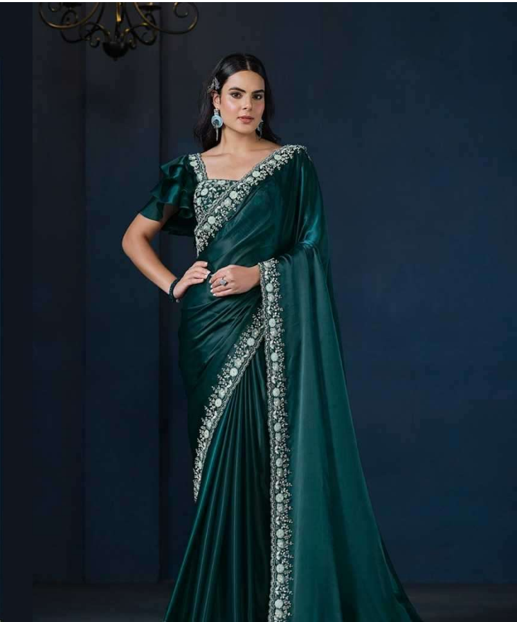
24515 FABRIC : CREPE SATIN SILK BLOUSE : EMBROIDERED