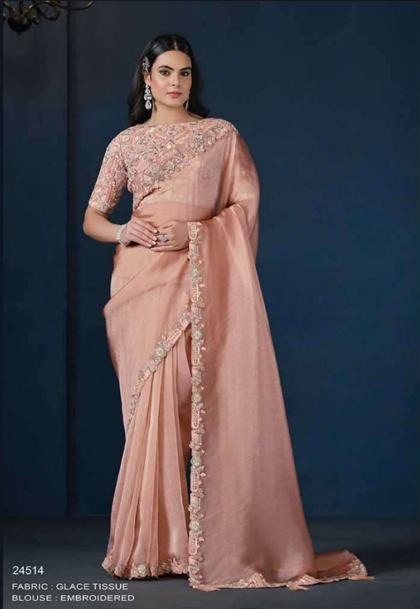
24514 FABRIC : GLACE TISSUE BLOUSE : EMBROIDERED