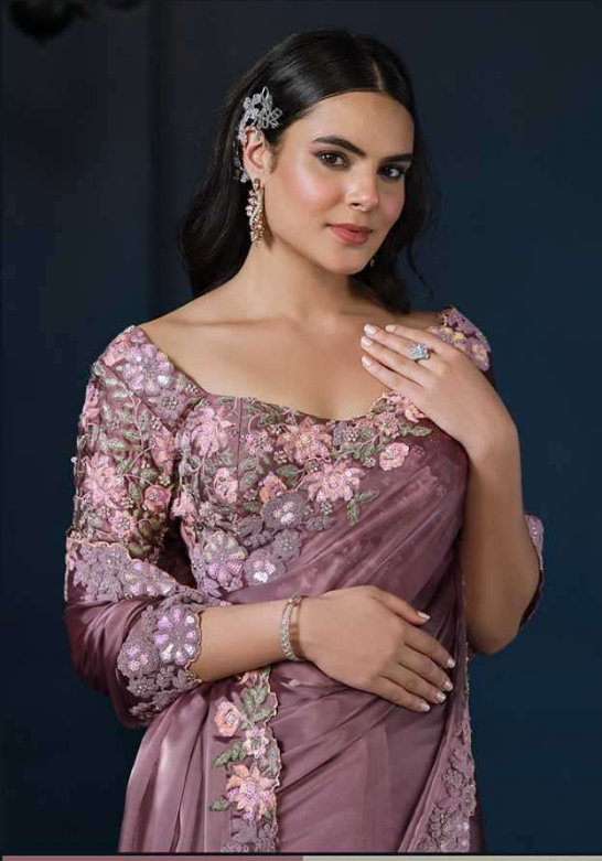
24518 FABRIC : CRAPE SATIN SILK BLOUSE : EMBROIDERED