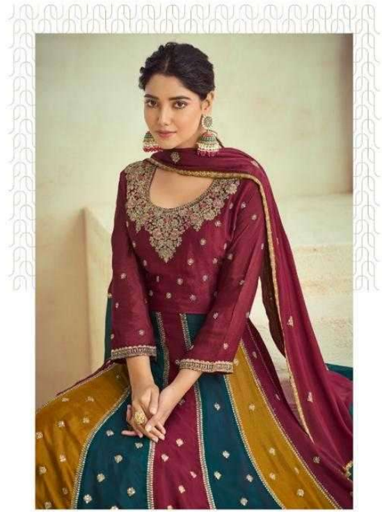
The Queen of Great India