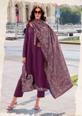
D | 1001