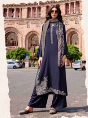
D | 1002