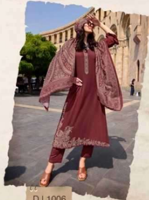
D | 1006