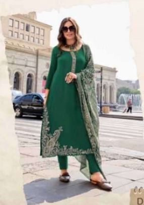
D | 1003