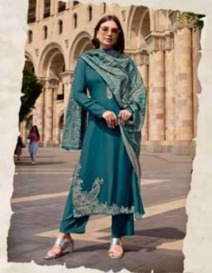
D | 1005