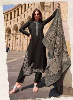
D | 1004