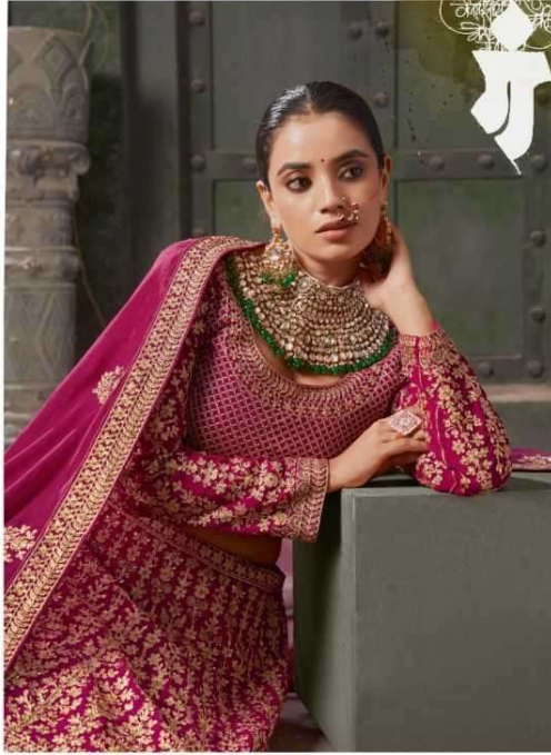
Overdressed and undercharged in this stunning lehenga D.no-12002