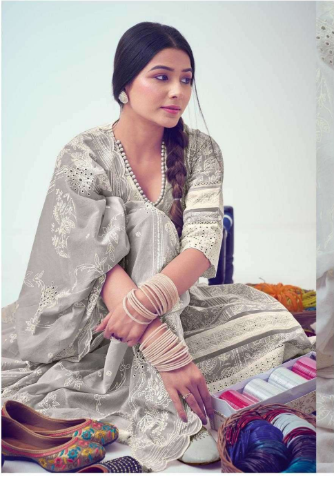
THE NEW AGE STYLE CALLS FOR A CHANGE IN TREND. DITCH HEAVY EMBROIDERY FOR SPECTACULAR PRINTS ON THE LIGHTER-THAN-AIR DRESS.