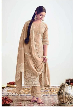
LOOK | 8924