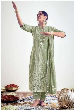
LOOK | 8921