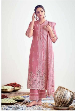
LOOK | 8923