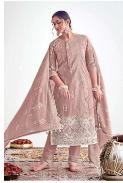
LOOK | 8926