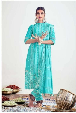
LOOK | 8922