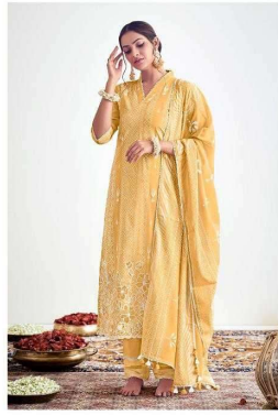
LOOK | 8925