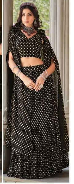
CODE | 2326