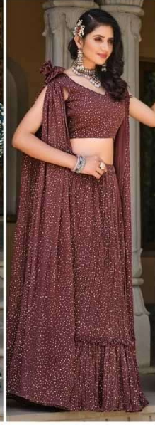
CODE | 2325