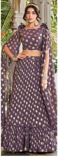
CODE | 2321