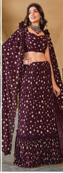
CODE | 2323