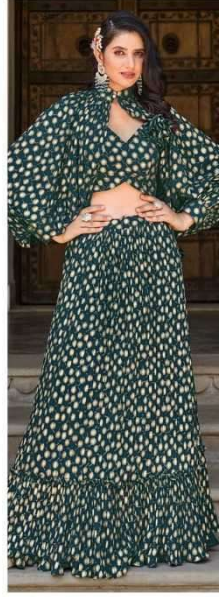
CODE | 2324