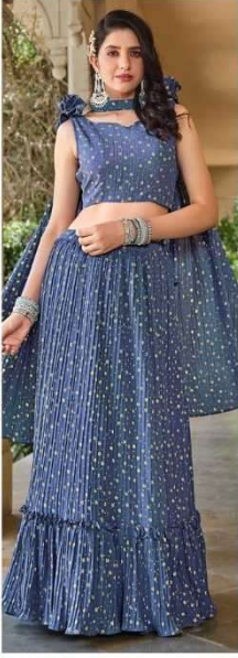
CODE | 2322