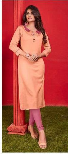
..... 52 .....