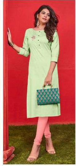
..... 54 .....