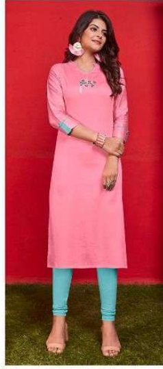
..... 53 .....