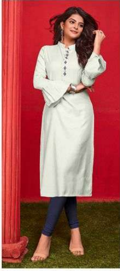
..... 51 .....