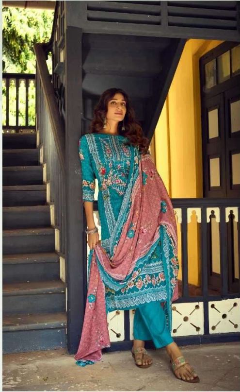
Simplicity a current trend that you sport with a personal take