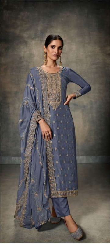
Brighten up your festive mood D.NO.14873