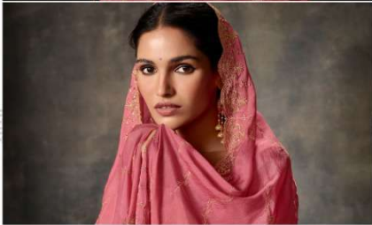
The art of being graceful D.NO.14872