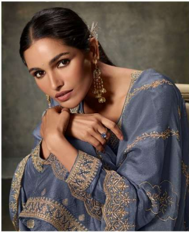
Brighten up your festive mood D.NO.14873