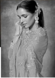
Get ready for summer festivities.