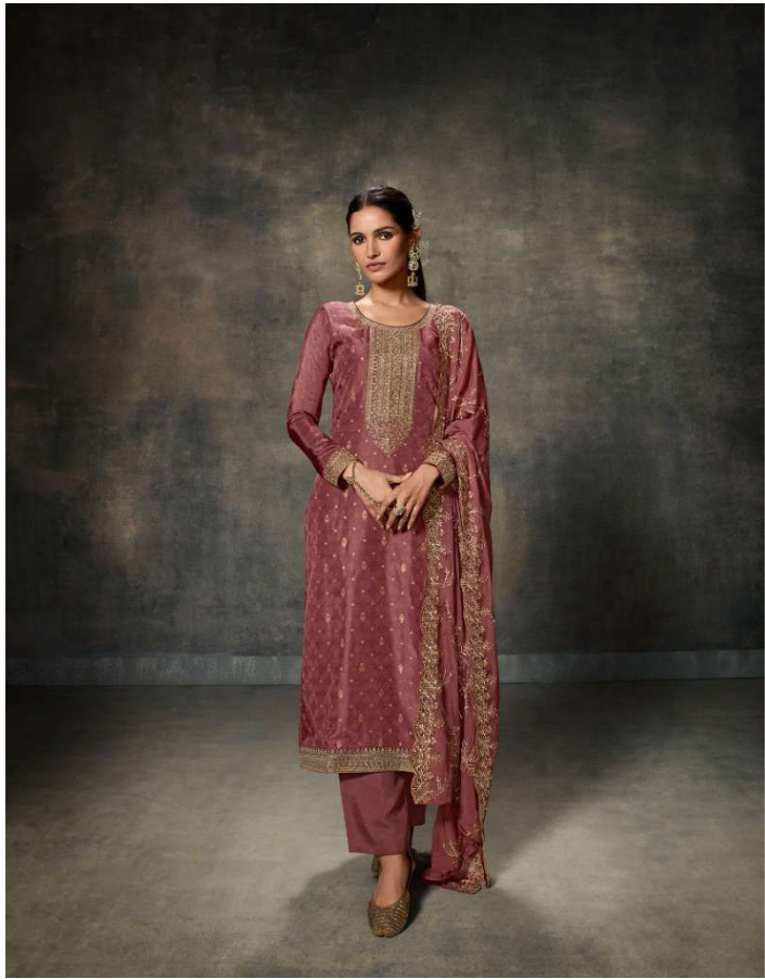
Set your own fashion goals D.NO. 14875