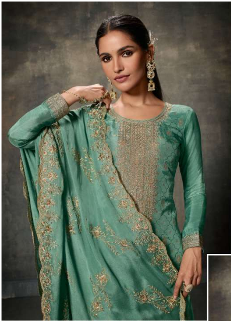
Embrace elegance and poise. D.NO. 14871