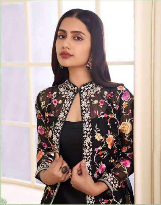
Elegant 2052 - A