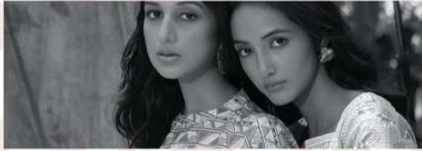
"When the grace and culture shook hands, kurti was born!"