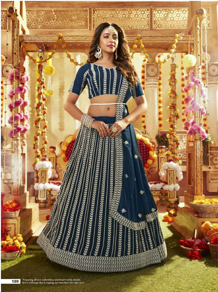
120 "Featuring all-over embroidery and dream-worthy details, here's a Lehenga that is rapping our minds like a raga now."

Wispy Wonders: Classics with a contemporary twist are always top picks!