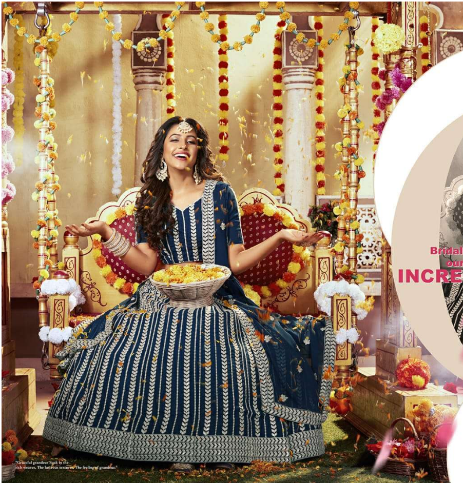
"Gracious grandeur" got to the rich women. The fashion recreates the feeling of grandeur.