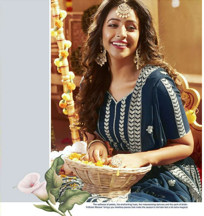
"The softness of petals, the enchanting hues, the mesmerising textures and the spirit of bride - 'A Bride's Memory' brings you timeless pieces that make the season's intimates feel a bit extra magical."