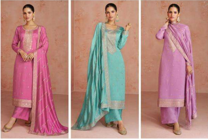
■ ■ 9602 ■ ■