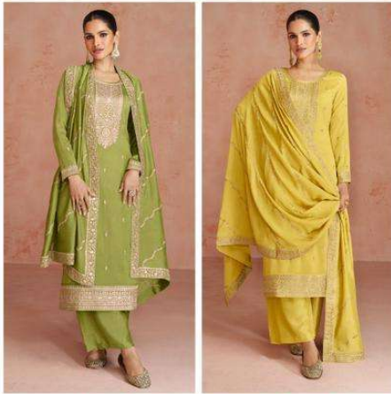
■ ■ 9605 ■ ■